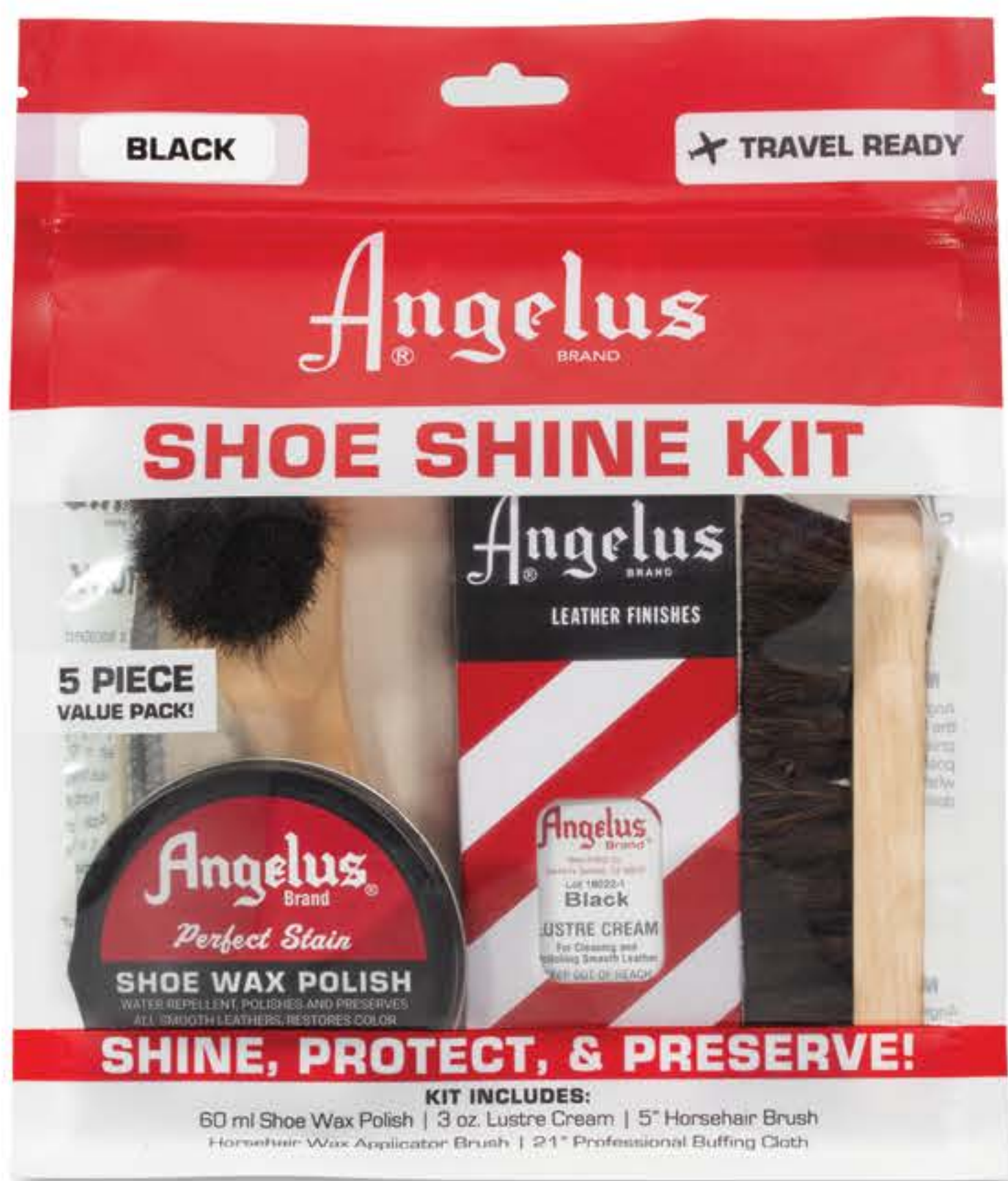
#411 Shoe Shine Travel Kit - pg 21

Colors - Black, Brown, Lt. Brown, Dark Brown, Tan, Cordovan, Grey, Mahogany, Mid-Tan, Navy Blue, Midnight Green, Neutral, Oxblood, Red, and White