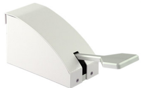
H52 Dynamic Search