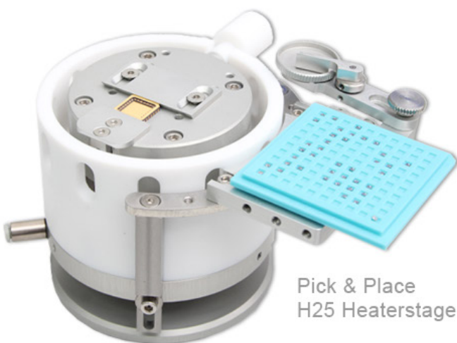
Pick & Place H25 Heaterstage