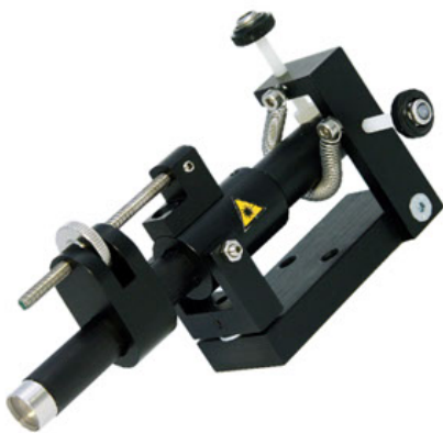
Spotlight tagetting system