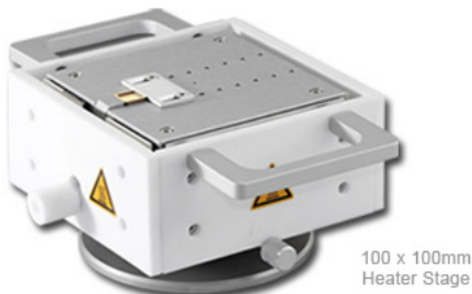
100 x 100mm Heater Stage