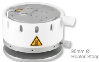
90mm \emptyset Heater Stage