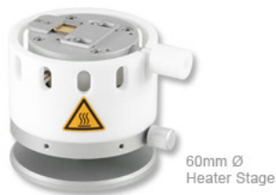
60mm \emptyset Heater Stage