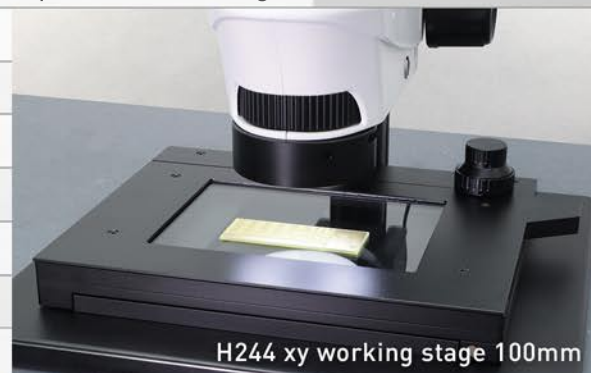
H244 xy working stage 100mm