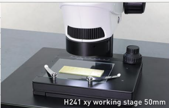
H241 xy working stage 50mm