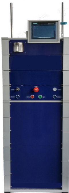
VSS-300 with cabinet

We offer a lot of different kind of closed loop water coolers and different pumps from e.g. Pfeiffer, Edwards, Leybold, Agilent. We recommend the correct configuration for your system.