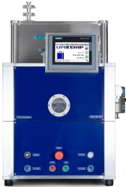
Technical and design changes reserved

up to 300 mm dia. or 300 mm x 300 mm substrate size