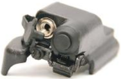
3.5mm Threaded adapter