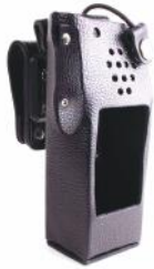
Leather Swivel Case