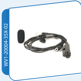
3.5mm pigtail,3.5mm earphone