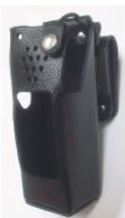
Genuine shoulder cowhide