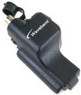
Hirose Quick Disconnect Adapter