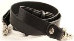
Genuine cowhide leather