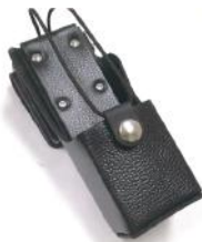
Leather Carrying Case