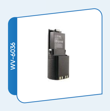
7.5V | 5100 mAh | Li-lon