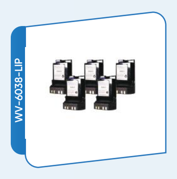
7.2V | 3400 mAh | Li-Ion Pack of 5