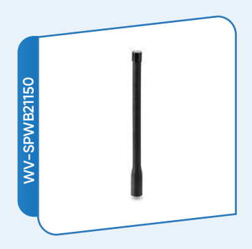
Size: 6.7" Frequency range: 136-174 MHz Motorola Wideband VHF Ant, SMA Female

Antenna is designed for use with Motorola APX8000 handheld radio.