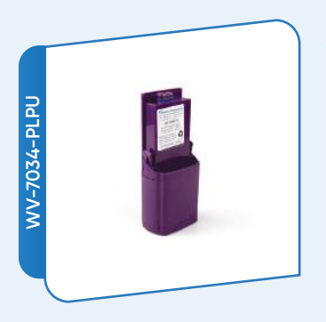
7.4V | 3500 mAh | Li-Po