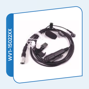
Color: Black 3-Wire Surveillance Kit with Hirose connector