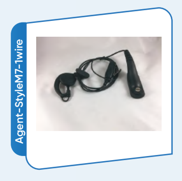
Color: Black Single-wire earpiece for Motorola APX 8000 radios