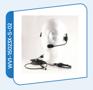
SPEAKER Impedance: 250 +-50 Ohms SPL: 97 +-3dB