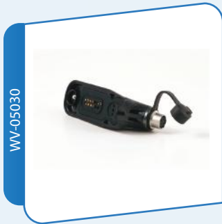
6-pin Hirose adapter