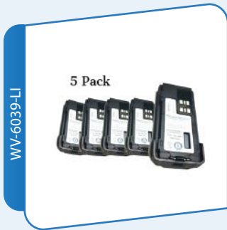
7.2V | 5000 mAh | Li-Ion