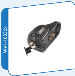
3.5mm accessory port