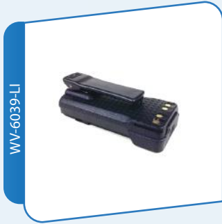
7.2V | 2500 mAh | Li-Ion