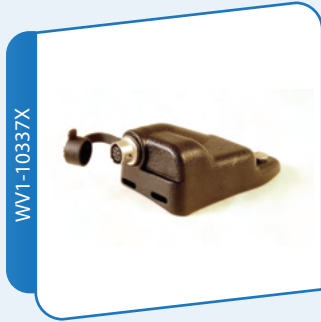
Quick Disconnect Adapter