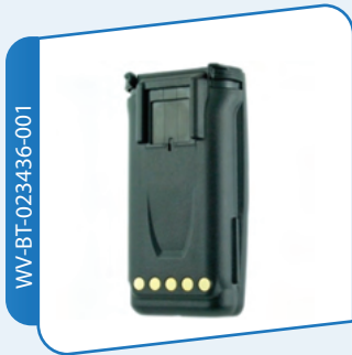
7.4V | 4100 mAh | Li-Po