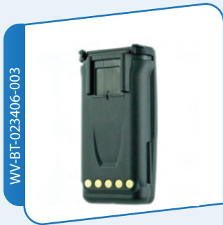
2700mAh | NiMH