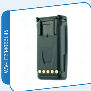
2000mAh | Li Ion