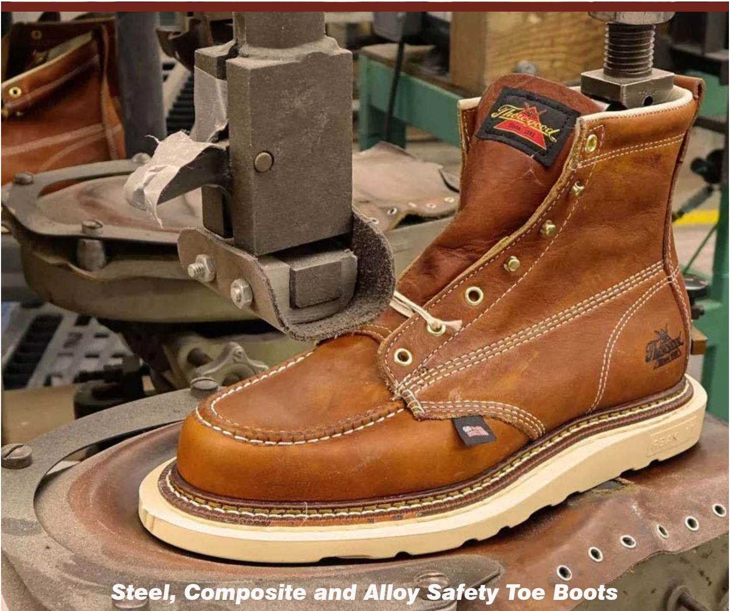
Steel, Composite and Alloy Safety Toe Boots