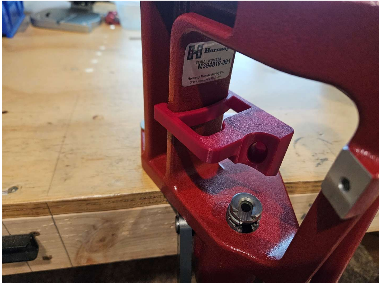
The catcher is now installed.