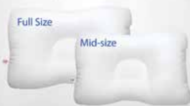
D-CORE® CERVICAL SUPPORT PILLOWS D-Shaped Center Head Cradle

California Residents Only: ⚠️WARNING: Cancer and Reproductive Harm – www.P65Warnings.ca.gov