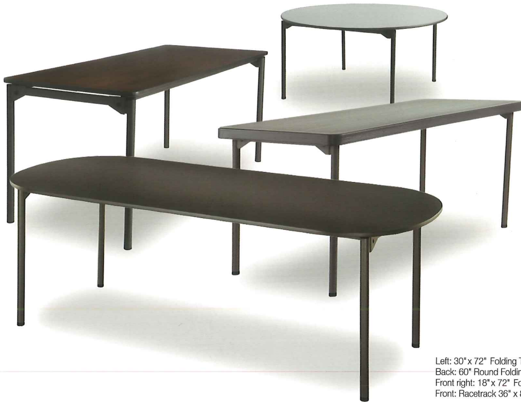
Left: 30" x 72" Folding Table with Walnut Finish Back: 60" Round Folding Table with Gray Finish Front right: 18" x 72" Folding Light Table with Gray Finish Front: Racetrack 36" x 84" Folding Table with Graphite Finish

Extreme quality in a table that meets every commercial and institutional need. Innovative open corner leg design eliminates the need for a cross bar – providing maximum leg room and seating capacity. Single cam, one-hand leg fold release saves setup time.