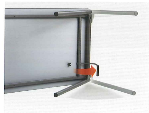
Single cam fold release for one-handed set up