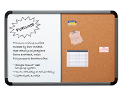
36037 Dry Erase/Cork Bulletin Charcoal 36" x 24"