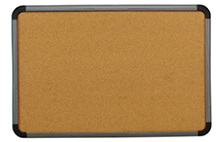
35037 Cork Bulletin Charcoal 36" x 24"