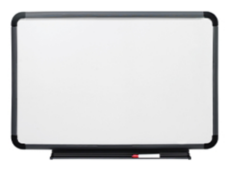
37039 Dry Erase with Marker Tray Charcoal 36" x 24"

Ingenuity™ Collaboration Boards are a break through in design, function and durability. They are the first communication boards employing one piece, blow-molded bodies with integral, living hinge frame faces which completely surround the board surface and provide full support against the wall. Lightweight and extremely durable, Ingenuity™ is the choice where utility and durability is preferred. Available as Dry Erase, Bulletin or Combination. All Iceberg products are backed by a 15 year manufacturer's limited warranty.