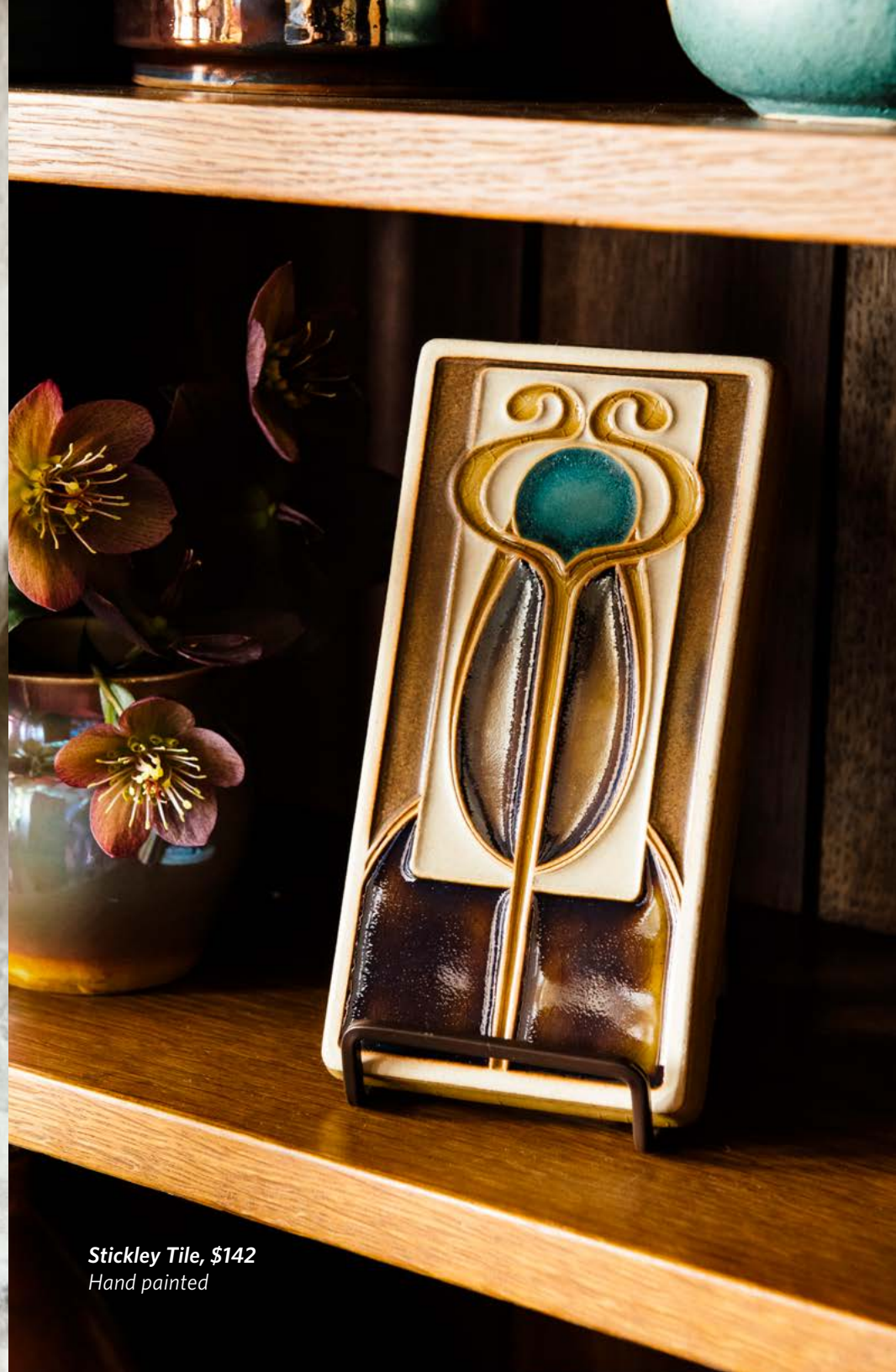
Stickley Tile, $142 Hand painted