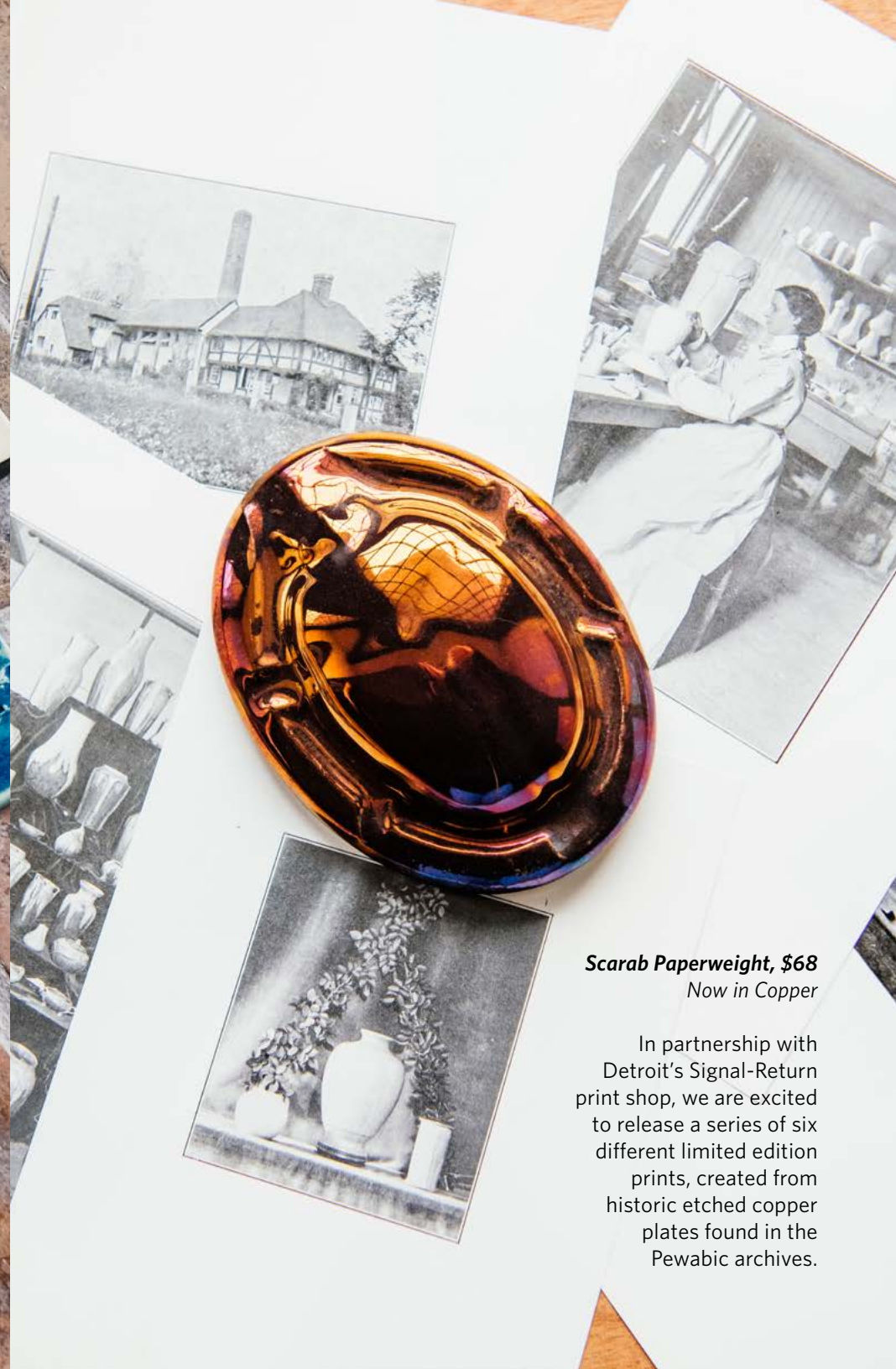
Scarab Paperweight, $68 Now in Copper

In partnership with Detroit's Signal-Return print shop, we are excited to release a series of six different limited edition prints, created from historic etched copper plates found in the Pewabic archives.