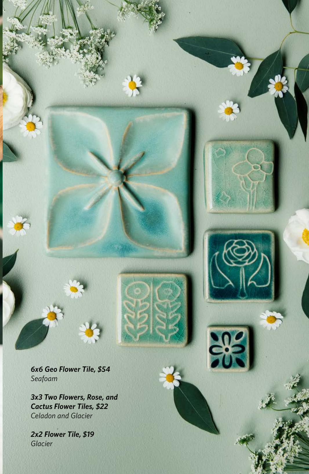
6x6 Geo Flower Tile, $54 Seafoam