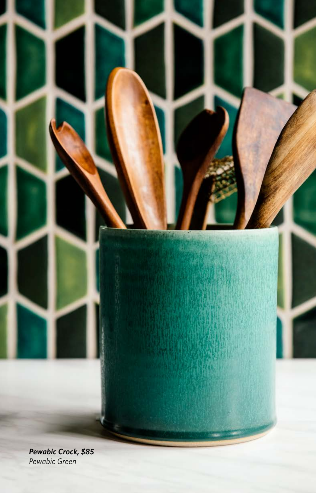
Pewabic Crock, $85 Pewabic Green