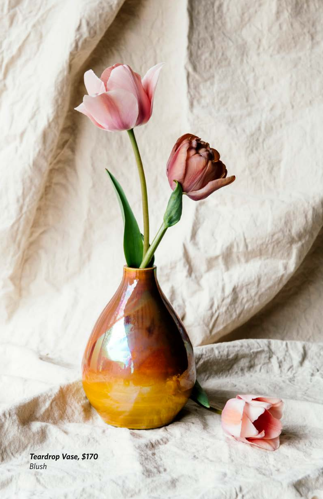
Teardrop Vase, $170 Blush