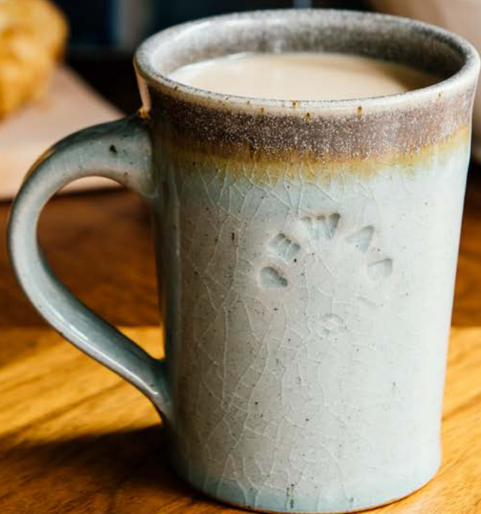
Cafe Mug, $54 Frost

This backsplash features our 3x3 field tiles in a blend of blue glazes.