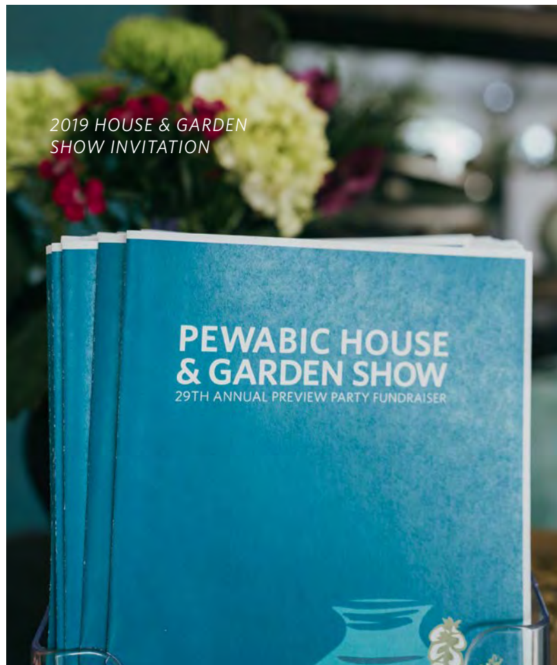
2019 HOUSE & GARDEN SHOW INVITATION