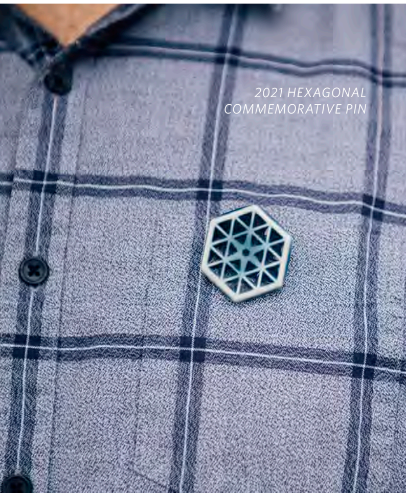
2021 HEXAGONAL COMMEMORATIVE PIN

A PEWABIC HOUSE & GARDEN SHOW INVITATION IS DELIVERED TO THOUSANDS OF PEWABIC MEMBERS AND SHOPPERS. EACH PREVIEW PARTY GUEST ENJOYS A 10% SHOPPING DISCOUNT THROUGHOUT THE EVENT.