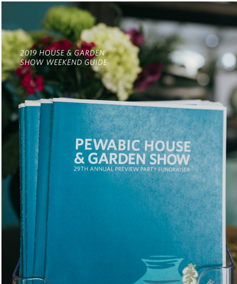
2019 HOUSE & GARDEN SHOW WEEKEND GUIDE