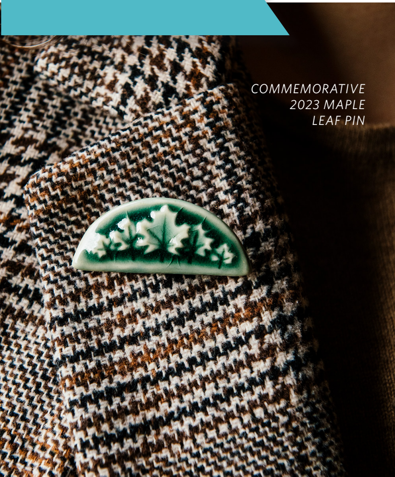
COMMEMORATIVE 2023 MAPLE LEAF PIN

A PEWABIC HOUSE & GARDEN SHOW INVITATION IS DELIVERED TO THOUSANDS OF PEWABIC MEMBERS AND SHOPPERS. THE WEEKEND GUIDE IS PASSED OUT TO EACH VISITOR AND PLACES YOUR BRAND DIRECTLY IN THE VIEW OF OUR GUESTS.