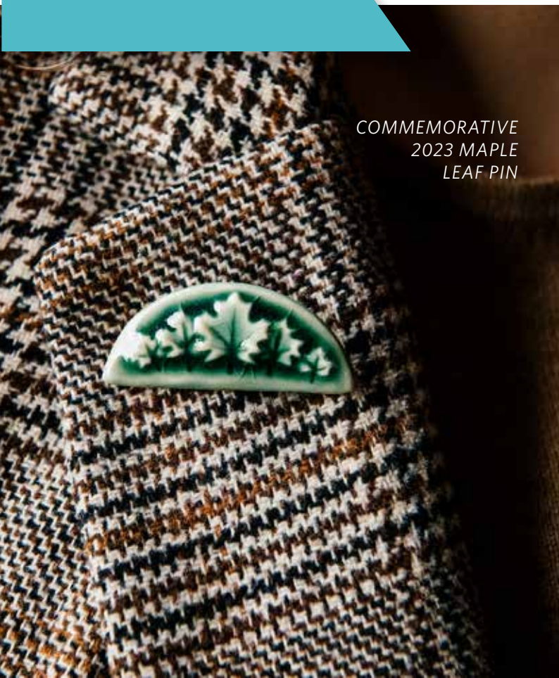
COMMEMORATIVE 2023 MAPLE LEAF PIN

A PEWABIC HOUSE & GARDEN SHOW INVITATION IS DELIVERED TO THOUSANDS OF PEWABIC MEMBERS AND SHOPPERS. THE WEEKEND GUIDE IS PASSED OUT TO EACH VISITOR AND PLACES YOUR BRAND DIRECTLY IN THE VIEW OF OUR GUESTS.