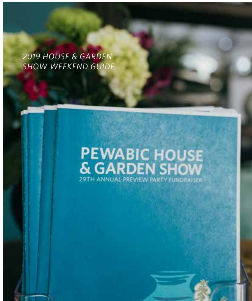
2019 HOUSE & GARDEN SHOW WEEKEND GUIDE