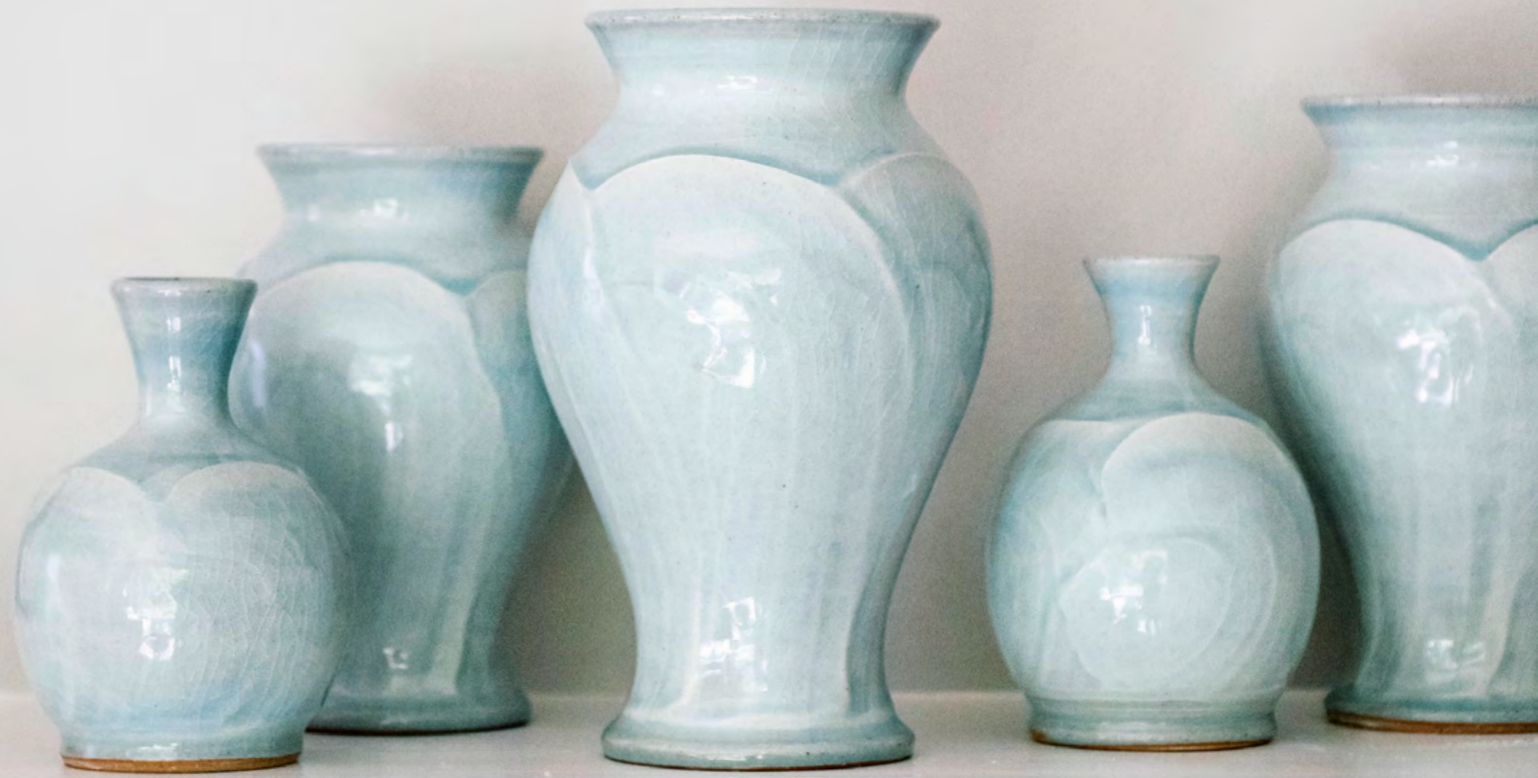
A misfire of our seasonal Winterberry glaze resulted in a small batch of pale transparent blue-green vases, inspiring us to create our new Frost glaze.

At Pewabic, we believe that beautiful objects made by hand elevate the daily art of living. We value thoughtful design that honors the timeless beauty of natural materials, and celebrate the city and state we've called home for over a hundred years.