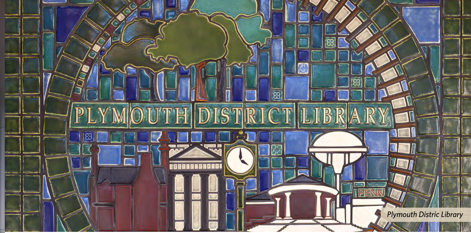
Plymouth Distric Library