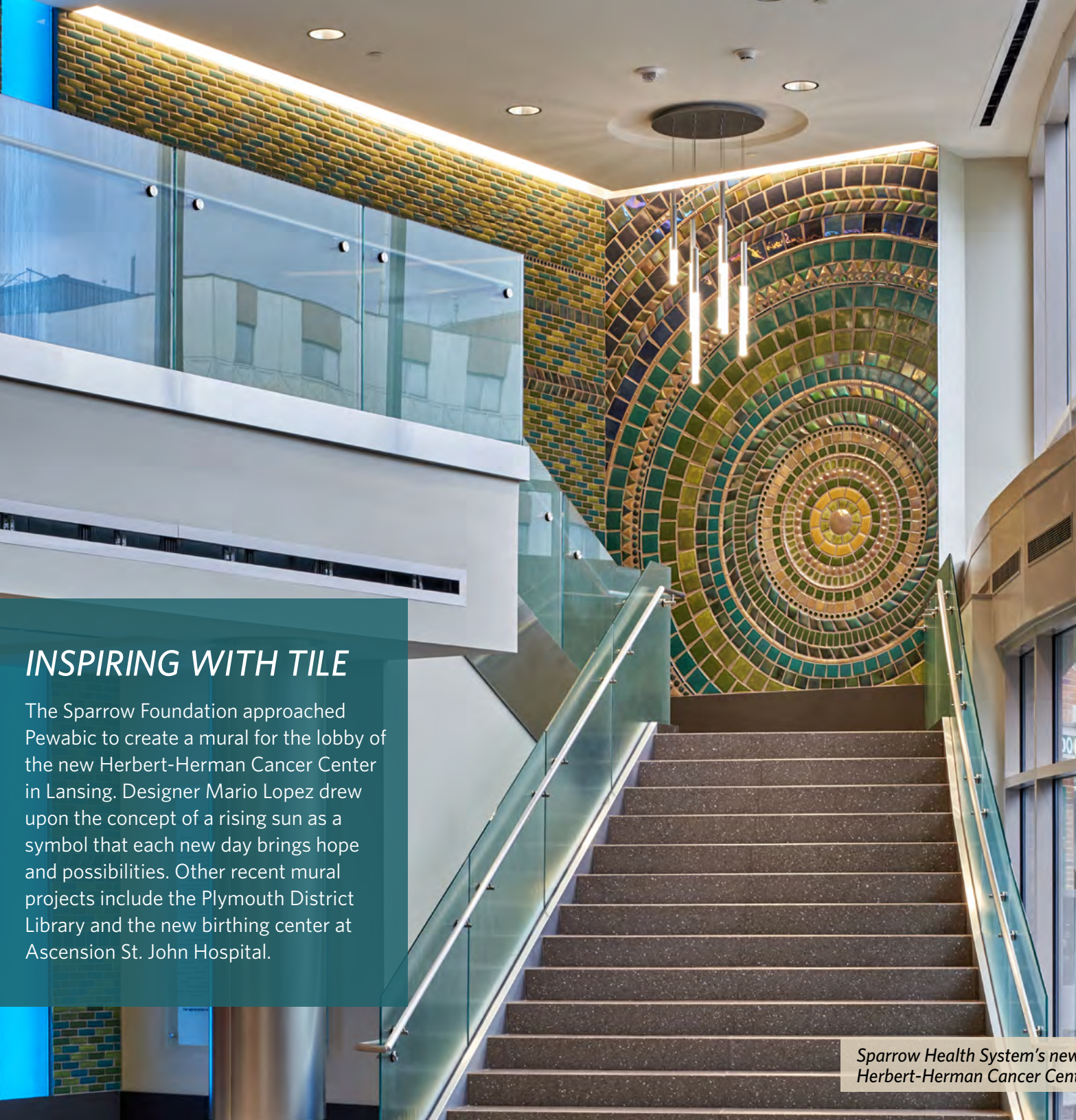
Sparrow Health System's new Herbert-Herman Cancer Center