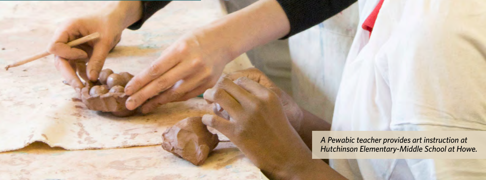
A Pewabic teacher provides art instruction at Hutchinson Elementary-Middle School at Howe.