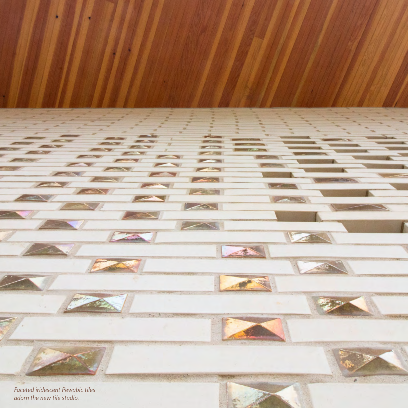
Faceted iridescent Pewabic tiles adorn the new tile studio.