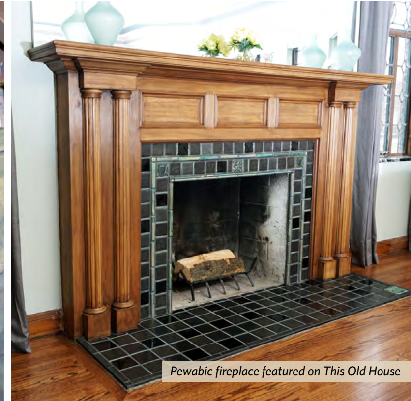
Pewabic fireplace featured on This Old House