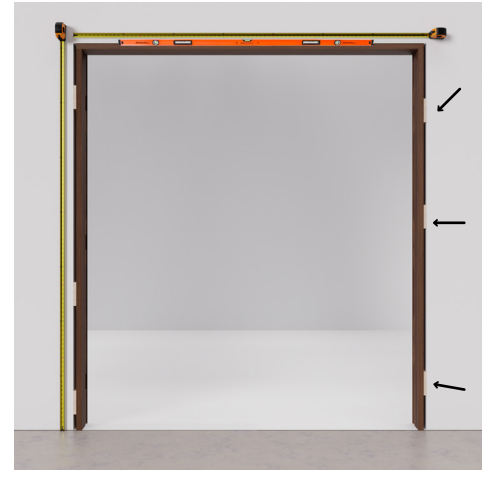
Step 4. Use mallet to ensure the unit is plumb. Check with a level and measuring tape to ensure that the unit is square and plumb. Secure jamb with at least one screw 3 inches long behind the weatherstripping at the top hinge and bottom hinge.