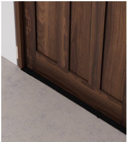
Step 9. Cut and test fit the aluminum threshold. Once the threshold has been test-fitted, apply at least three beads of silicone to the subfloor and set the threshold firmly in place.