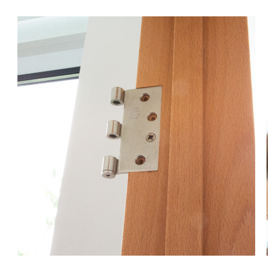
Step 5. Screw the hinges onto the jamb and onto the door slabs with two screws per hinge. Do not fully tighten the screw so that you can adjust the hinges if necessary.