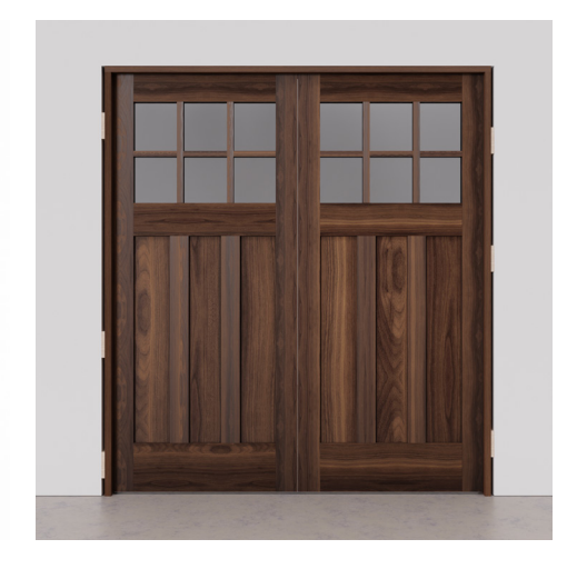
Step 7. Ensure the doors fit correctly by closing them and adjusting shims for the best fit and even gaps. Maintain an equal gap between door slabs at top and bottom. Adjust using shims/hinges until gapping is uniform. Finally, check for any binding issues.