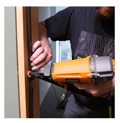
Step 8. Screw or nail the jamb to the studs behind the weatherstripping, so that the screws are concealed. Screws recommended. Place shims where you screw through the jamb.