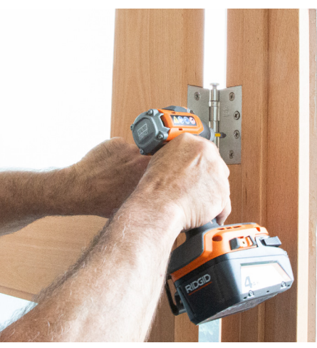
Step 6. Use the airbags to line up the hinges on the door and jamb, then set the pin in place. You may need to continue adding shims at this point. Once all hinges are in place, tighten the screws. Insert all hinge screws.