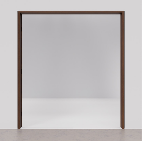
Step 3. Place the jamb in the opening, securing with shims for a snug, even fit. Confirm it's square by ensuring diagonal corner-to-corner measurements match. Check jamb legs for plumb with a level so your doors are easier to hang.

Step 2 . Assemble the jamb using the predrilled holes.