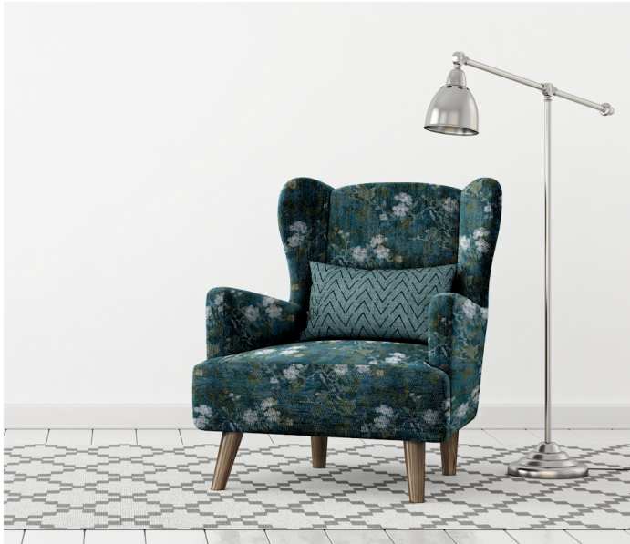
BLOSSOM FORGET ME NOT