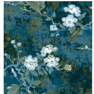
FORGET ME NOT