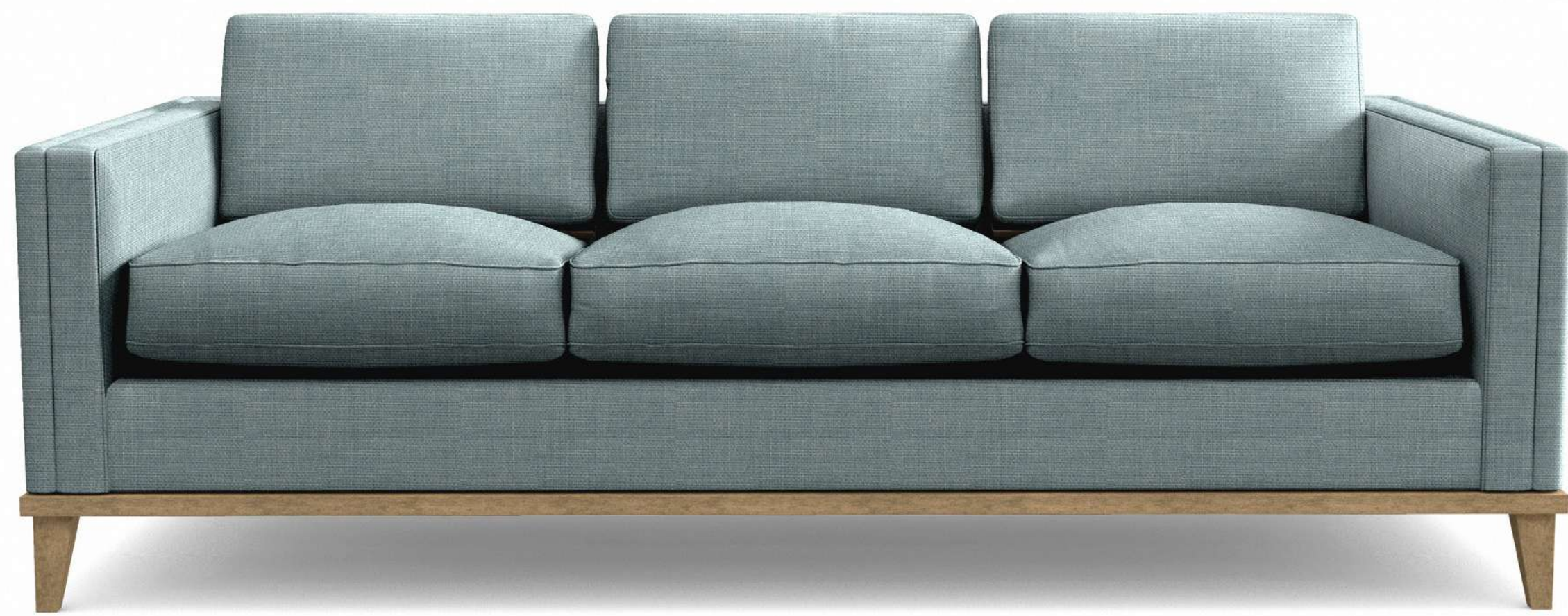
Couch covered in TESSUTO FRESCO