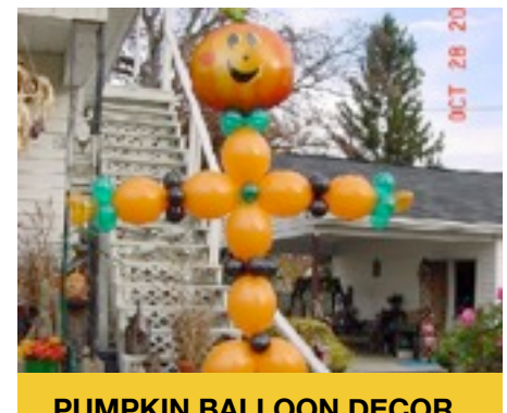
PUMPKIN BALLOON DECOR