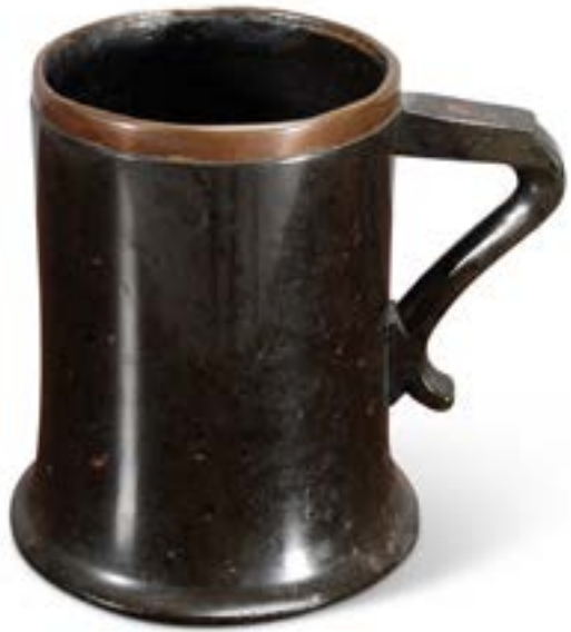
A SERPENTINE TANKARD WITH BRASS RIM English, 19th Century. 6.5" wide, 5.25" deep, 6.25" high.