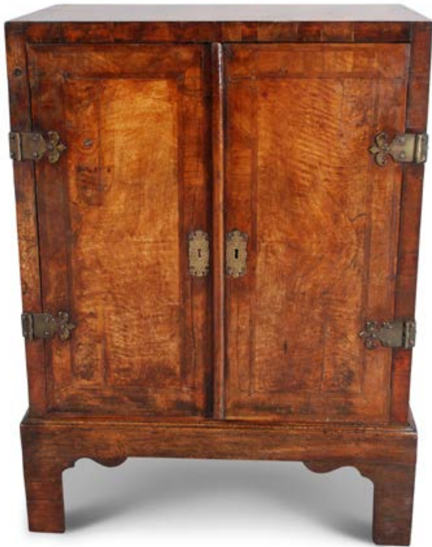
AN EARLY WALNUT AND OAK CABINET ON STAND

English, circa 1715. 35" wide, 19.5" deep, 46.5" high.