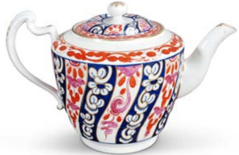
A WORCESTER TEAPOT IN 'QUEEN CHARLOTTE PATTERN' English, circa 1770. 9.5" wide, 5.5" deep, 6.5" high. Of tapering cylindrical form and with open crescent mark on the bottom. Restorations to the lid and to a hairline crack around the body.