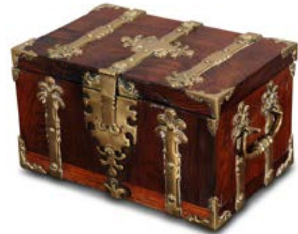
AN UNUSUALLY SMALL COFFRE-FORT Flemish, circa 1680. 9.25" wide, 6" deep, 5.25" high. A rosewood veneered strongbox bound in brass with carrying handles on the sides. Intended to store personal valuables, the box would have been secured to a table or floor to deter thieves. While the form is certainly recognizable, the small size is atypical.