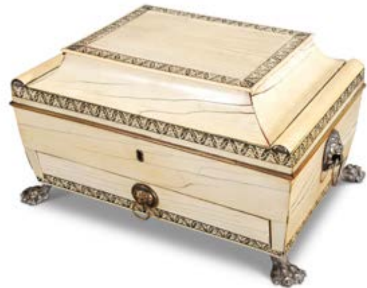
A REGENCY PERIOD IVORY WORK BOX

Anglo-Indian, circa 1820. 13.5" wide, 9" deep, 7.25" high.