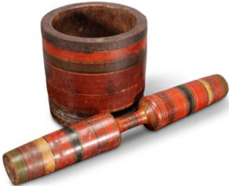
A LARGE PAINTED MORTAR AND PESTLE Continental, circa 1800. The mortar: 11" diameter, 11" high. The pestle: 26.5" long. The mortar is bound top and bottom with iron bands. It is painted in rings of red, green, yellow, and black as is the double-ended pestle.