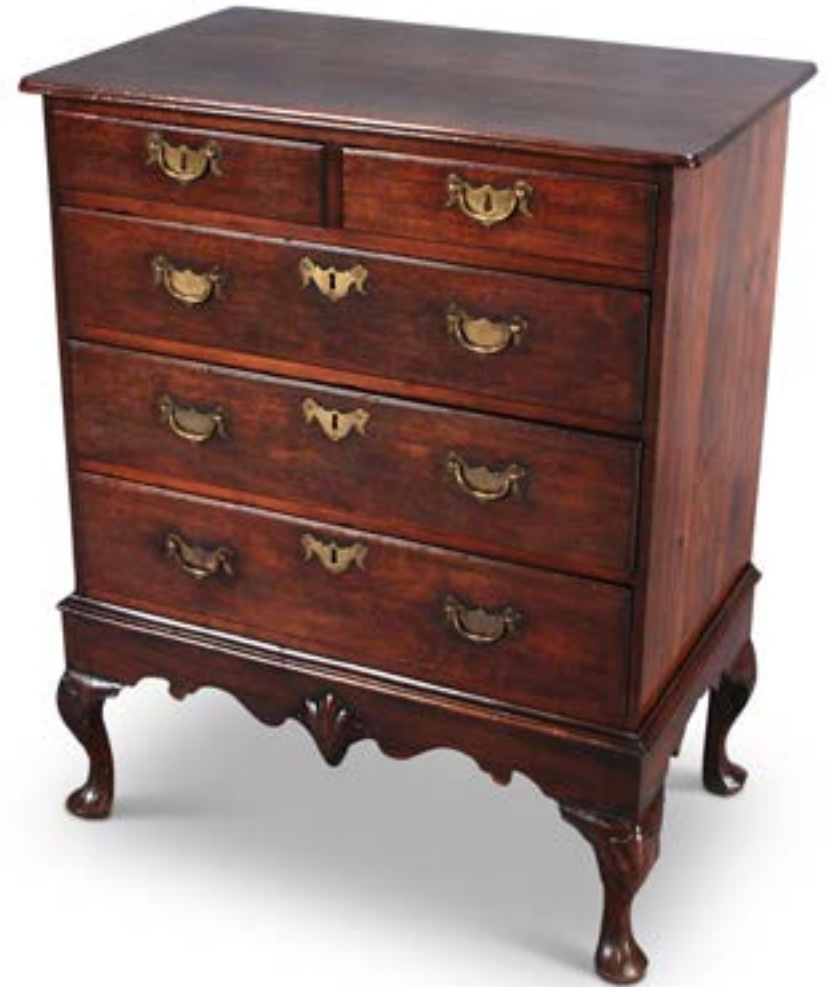
A GEORGE II PERIOD WALNUT CHEST ON STAND

Standing on four well-drawn cabriole legs ending in pad feet and with carved C-scrolls inside the knees. The single drawer retains the original brass handle. Retaining a warm color and patina.