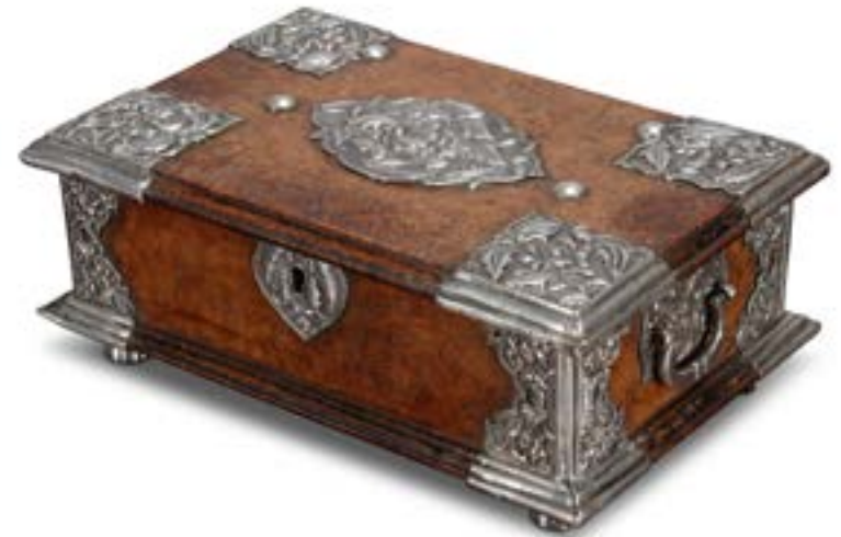
A SMALL BURR BOX WITH SILVER MOUNTS Anglo-Indian, 18th Century. 9.75" wide, 6.5" deep, 3.75" high. With elaborate floral repousse silver mounts. The handles, feet, and strap hinges are silver as well.