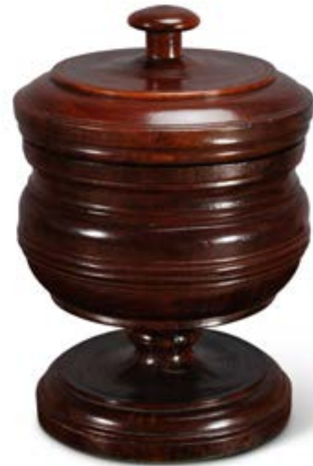
A LIGNUM VITAE TREEN TOBACCO JAR WITH LID English, 18th Century. 7" diameter, 10.5" high. A finely turned example of substantial size and weight.