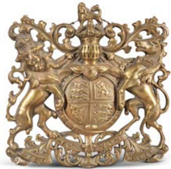
A SMALL CAST BRASS COAT OF ARMS English, circa 1900. 15" high, 15" wide.

An unusual two-door cabinet on stand. The doors and top veneered in beautifully figured walnut. The sides are built out of solid oak. The doors are book-match veneered, cross-banded, and feather-banded. Original brass hinges. The interior is divided into eight compartments. Outstanding patina throughout. Restorations to the feet.