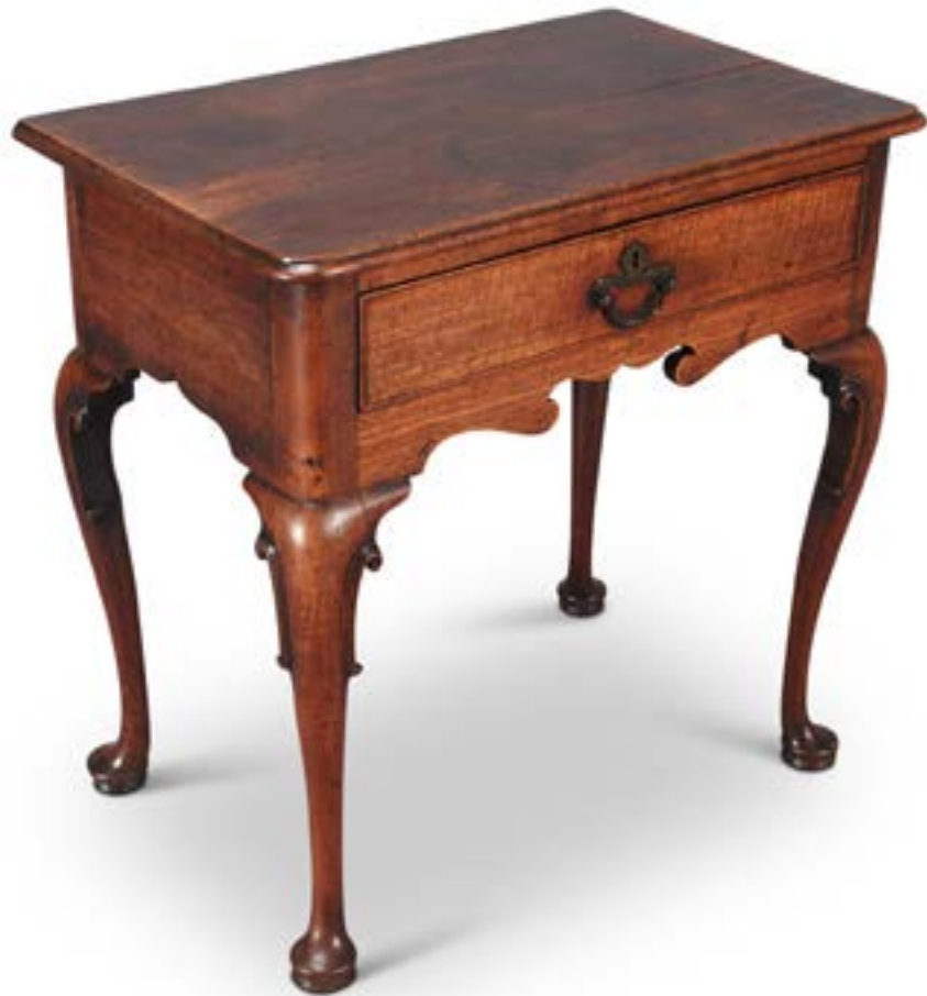
A GEORGE II PERIOD SOLID WALNUT SIDE TABLE

English, circa 1750. 29" wide, 18.5" deep, 29" high.