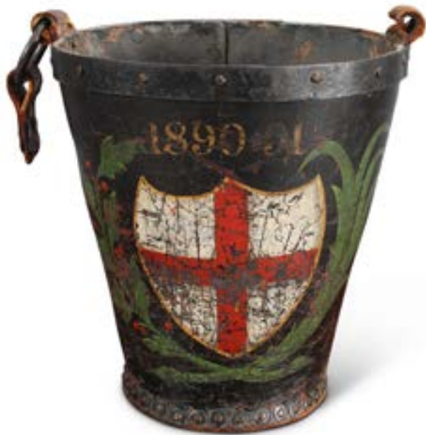
A BLACK LEATHER FIRE BUCKET English, dated 1890-91. 10.5" diameter, 11.5" high. Painted with an armorial shield bearing St. George's cross. Lacking the handle.