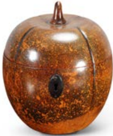
A REGENCY PERIOD MELON-SHAPED TEA CADDY English, circa 1810. 4.25" diameter. 5" high. Retaining the original mottled surface as well as the original steel escutcheon and some of the foil lining.