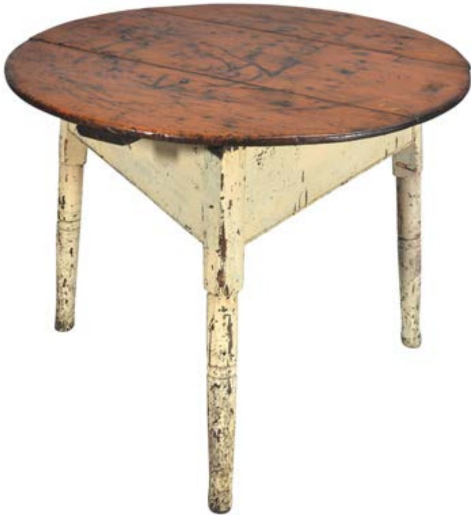
A PINE CRICKET TABLE ON PAINTED BASE

English or Welsh, circa 1840. 31.75" diameter, 25.5" high.