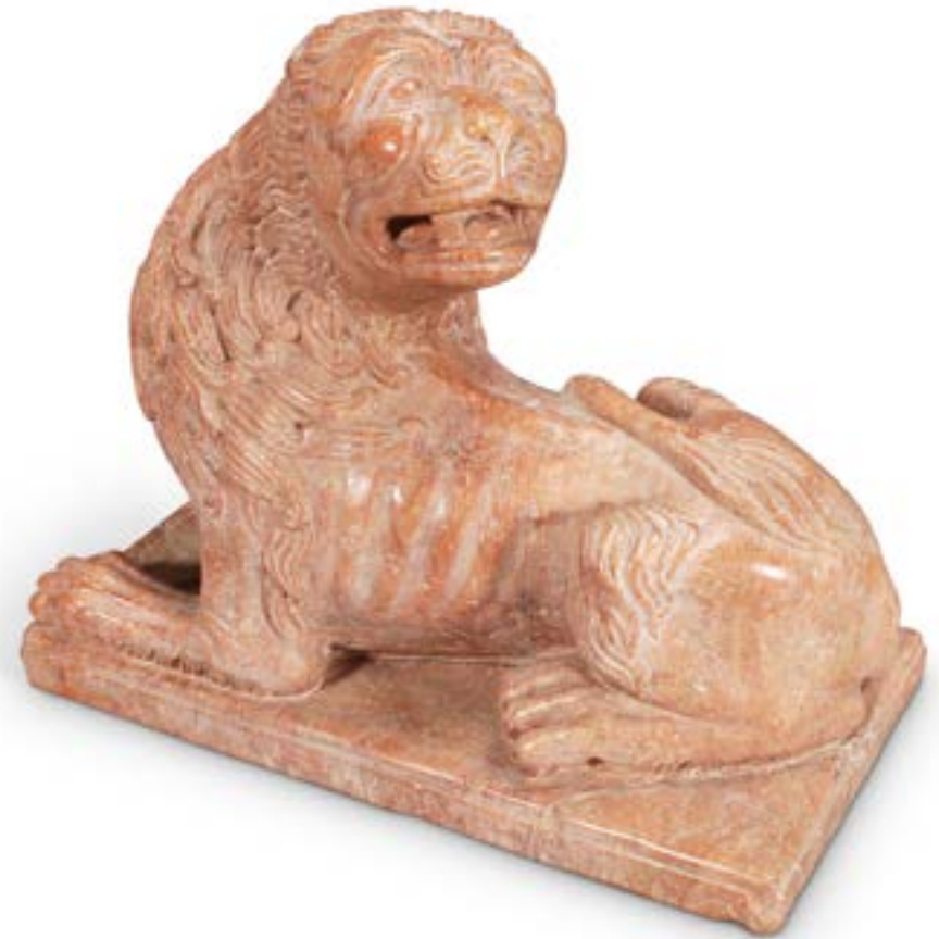
A CARVED MARBLE FIGURE OF A COUCHANT LION

The well-figured, three-board top is supported by a shaped apron and raised on splayed, tapering legs. Retaining an exceptional patina.