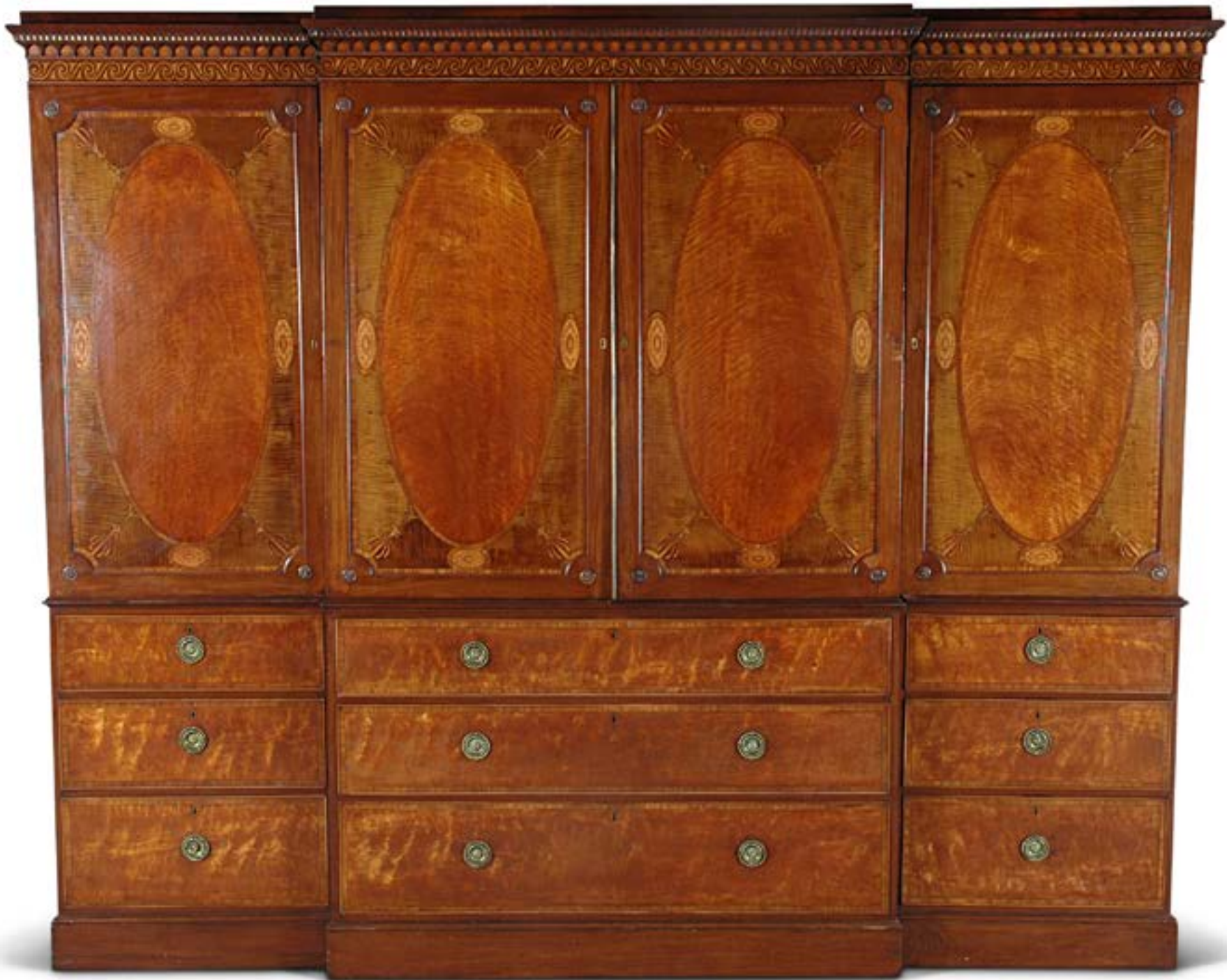
A SHERATON PERIOD SATINWOOD BREAKFRONTED PRESS English, circa 1795. 111.5" wide, 24.25" deep, 91.25" high.

The doors are inset with satinwood ovals outlined by rosewood banding and surrounded by harewood quadrants which are further adorned with penwork oval paterae and inlaid anthemias in the corners. The cornice is inlaid with a frieze of Vitruvian sea scrolls. Handles replaced. By repute made for the Earl of Loudoun, Loudoun Castle, Ayrshire.