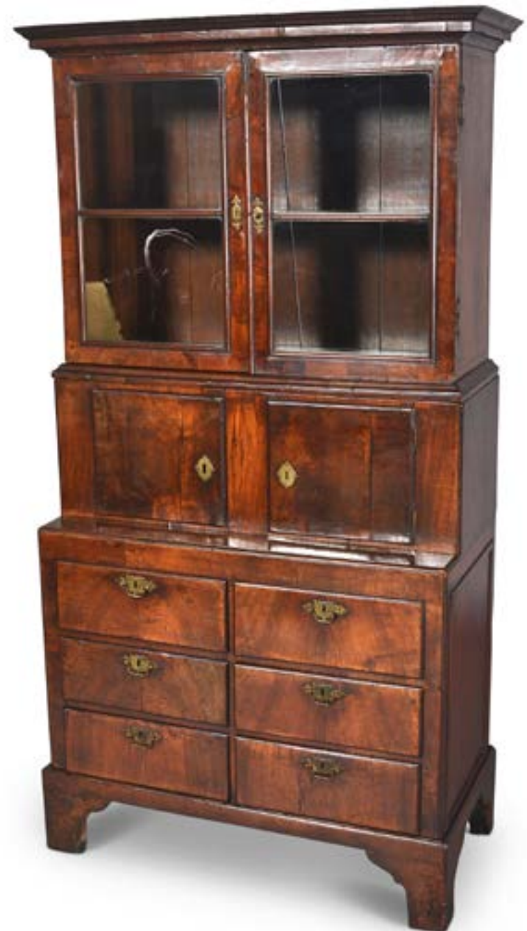
AN UNUSUAL GEORGE I PERIOD WALNUT CABINET English, circa 1715. 35.75" wide, 18" deep, 71" high.

The three-board top has a nice, waxed surface with lots of marks and signs of use indicating it hasn't been recently re-polished. The base features turned legs and a deep apron and retains an old cream-painted surface.