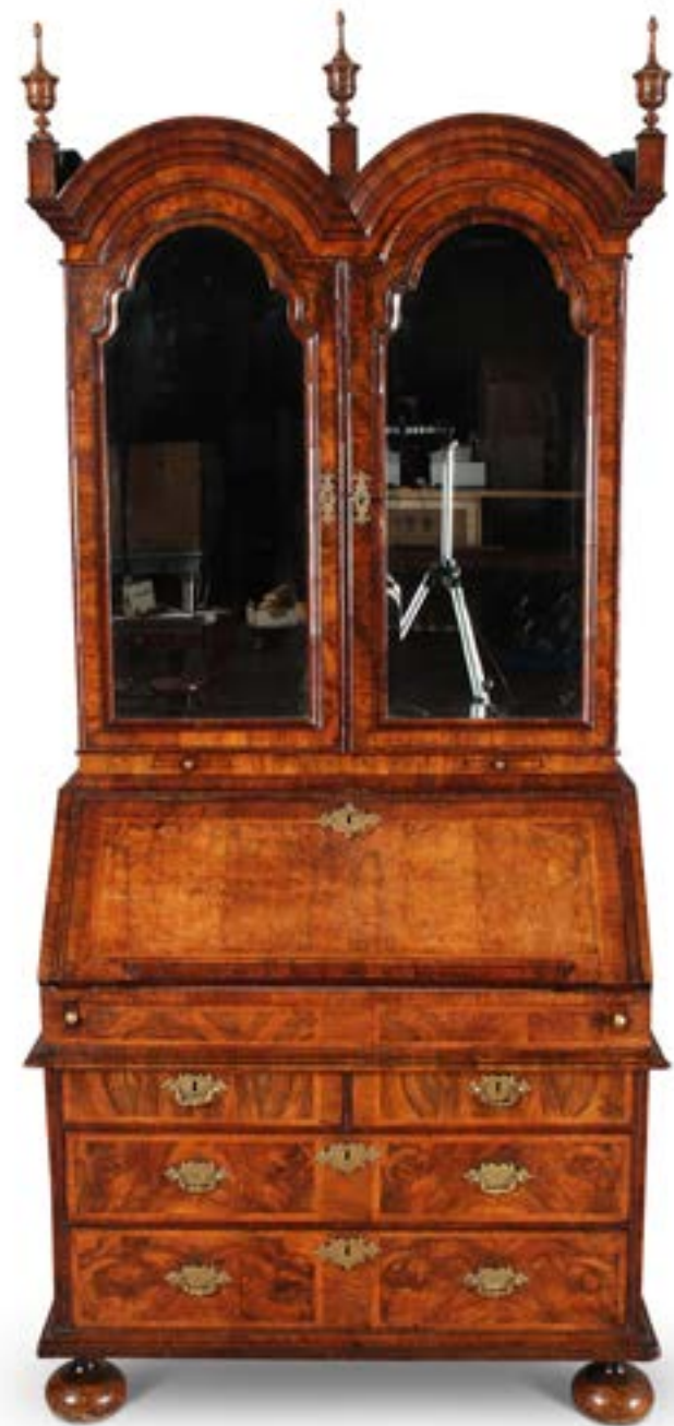
A GEORGE II PERIOD 'DOUBLE DOME' SECRETARY

A mahogany comb-back Windsor armchair of fine quality and unusual proportions. The finely shaped cabriole front legs are connected by well-turned H-stretchers to the turned back legs. The fretted back-splat has a small patch. The unusually high seat indicates that this chair may have been made to work at a tall desk or table.