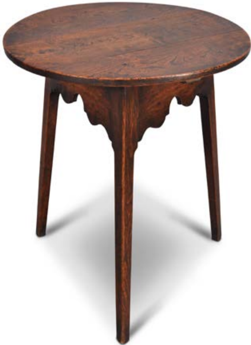
A FINE ELM CRICKET TABLE

English, circa 1750. 23" diameter, 26.5" high.