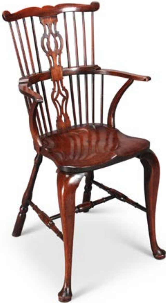
A GEORGE III PERIOD MAHOGANY WINDSOR CHAIR

English, circa 1760. 22.5" wide, 24.5" deep, 44" high, 22.5" seat height.