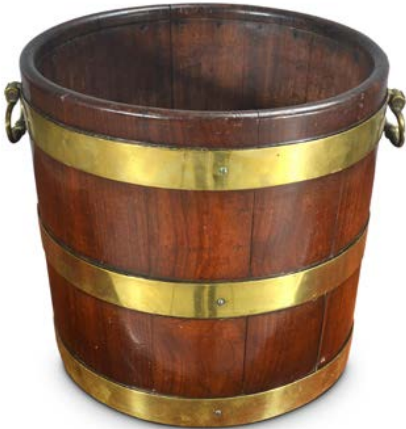
A GEORGE III PERIOD MAHOGANY BUCKET

English, circa 1780. 12.75" diameter, 12" high.