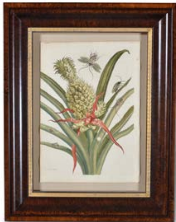
Maria Sibylla Merian (1647-1717) Metamorphosis Insectorum Surinamensium Amsterdam, 1705 and 1719 Engravings with original hand coloring Plates 63, 42, 64, 33, and 1 (pictured left to right, top to bottom) Sheet size: 20.5" x 14" Frame size: 29.75" x 23.25" Float mounted on a silk mat behind UVIII protective plexiglass in a burl wood frame with a gilded slip molding.