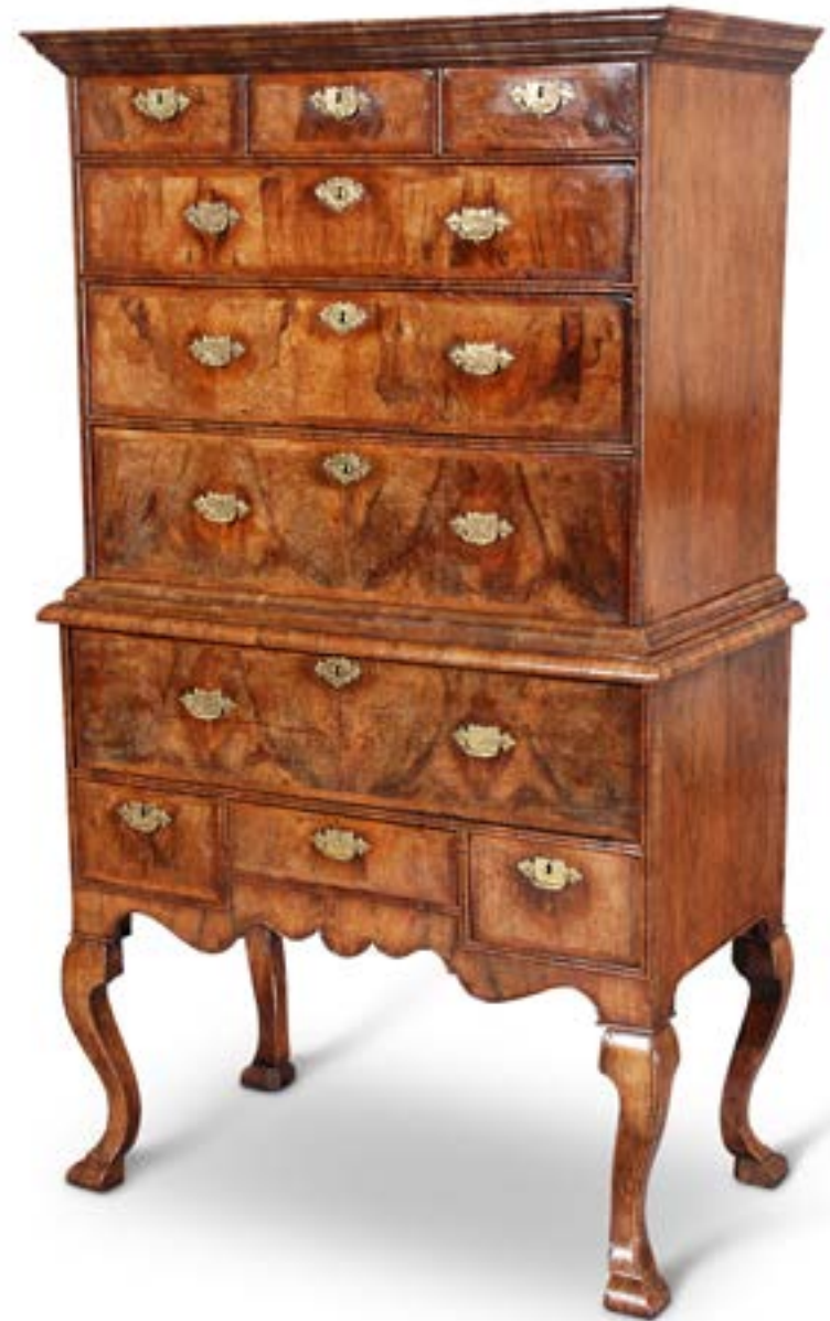
A GEORGE II PERIOD WALNUT CHEST ON STAND

Bound with three brass bands and retaining the original hinged ring handles. Of slightly tapered form.