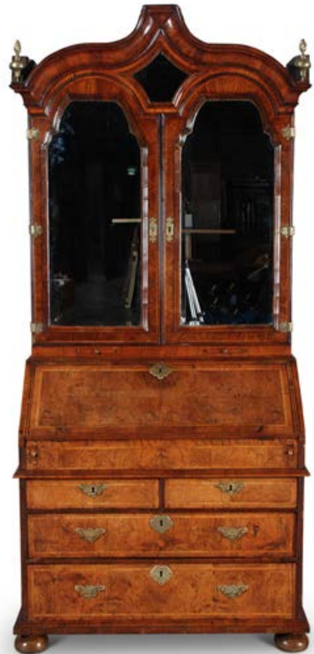
GEORGE II PERIOD WALNUT BUREAU BOOKCASE

An elegant armchair on four cabriole legs. The exposed, well-molded frame is carved with flowers and leaves at the top of the back and front of the seat rail. Currently upholstered in a fine blue and gold silk damask.