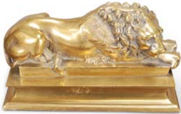
BRASS FIGURE OF A RECUMBENT LION European, circa 1900. 8.5" wide, 3.75" deep, 5" high. Resting on a stepped plinth. After Antonio Canova.