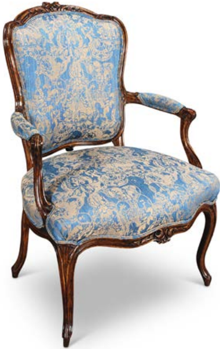
LOUIS XVI STAINED BEECH FAUTEUIL

French, circa 1780. 25.5" wide, 19" deep, 36" high, 17.5" seat height.