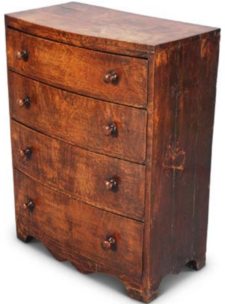
BURR OAK BOW-FRONTED CHEST OF DRAWERS

English, circa 1830. 28" wide, 16" deep, 37" high.