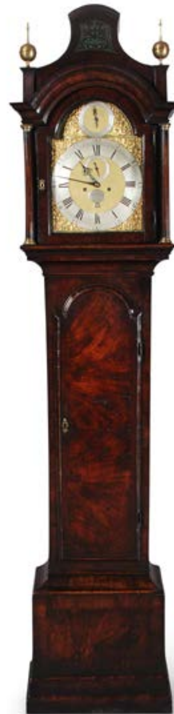
GEORGE II PERIOD WALNUT VENEERED TALL CASE CLOCK

An English occasional table in mahogany with a green variegated marble top. Stamped underneath the base "W & C Wilkinson 14 Ludgate Hill 8623." The two-inch thick top has a molded edge to give a lighter appearance. The molded legs end in scroll feet. Wilkinson was a London cabinetmaking firm active from 1808-87.