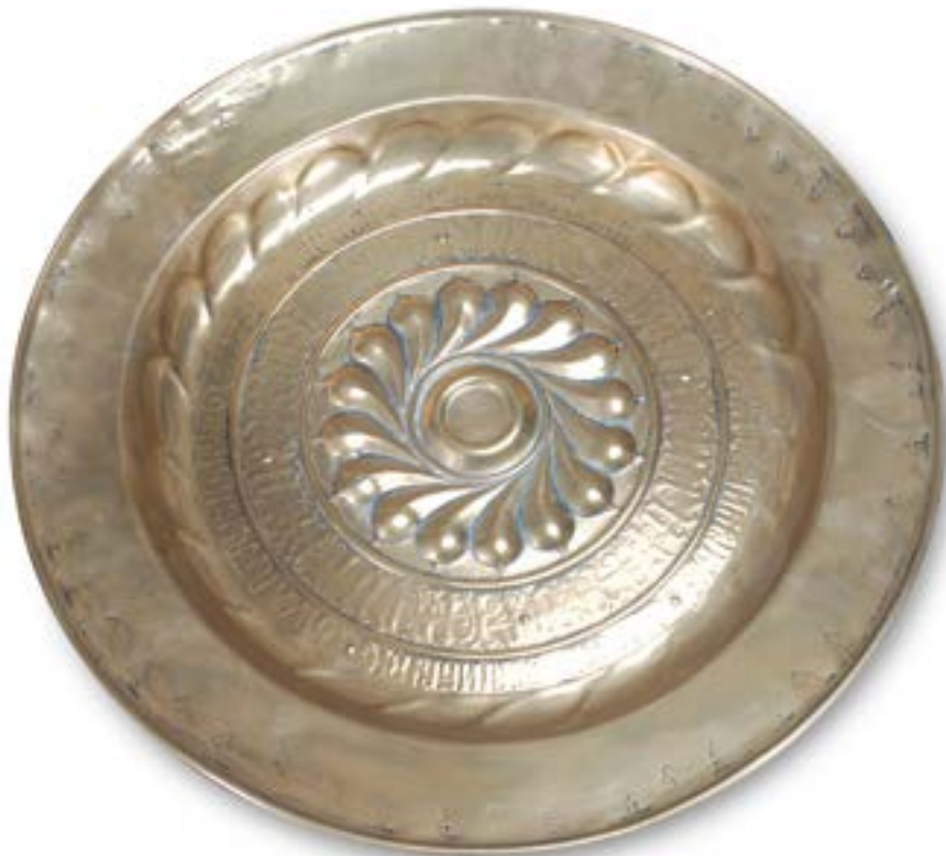
NUREMBERG BRASS ALMS PAN German, 16th Century. 16" diameter. The central, gadrooned boss is encircled by two bands of text. Also with a punched decoration around the rim.

A provincial chest of drawers with bow-fronted shape, caddy top, and shallow proportions. The four drawers are fitted with the original turned wooden knobs. Terrific figure to the grain and excellent patina. Some old, possibly original patches to the top and one side.