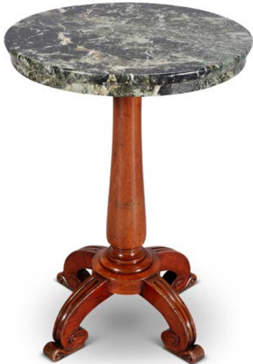
WILLIAM IV PERIOD MARBLE TOP OCCASIONAL TABLE