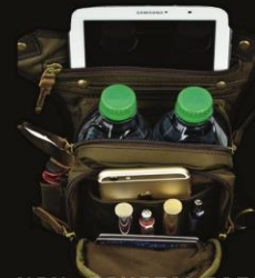
NON- CONCEAL CARRY