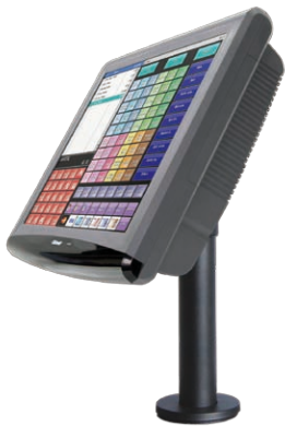
Pole mount option