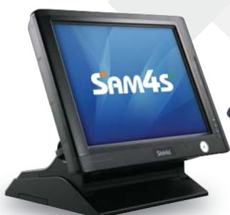
Sam4s SPT-3700 Touch Screen