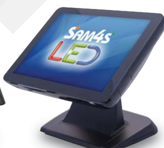
Sam4s SPT-4801 Touch Screen