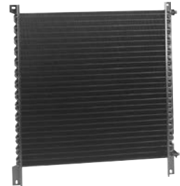
77R6950 357,377,378,379,385 Tube and fin style 18-03809