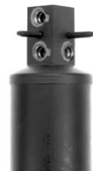
74R2001 Conventional and C.O.E F37-6000/ JA2225