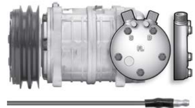
75R8382Q Sanden4509 /4510 LE1620