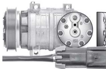
75R89582Q Cummins ISM, C10, C12 18-05000