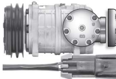
75R89552Q Fits 377, 379 with Cat3406E F69-6001-231, 1CC4696