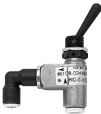
72R0600 Fits Conventional and C.O.E BA1210/ 08-02445