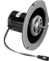
73R3142 Conventional and C.O.E HA0983 / 3X010983