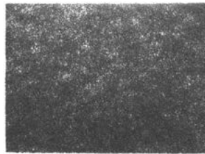
78R5308 Fits Conventional and C.O.E BSM525838 / 3199021