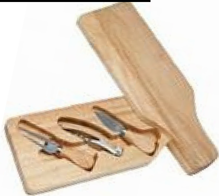
Wine Shaped Wooden Cheese Board with Utensils