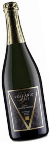
2019 Bubbly Gewurztraminer