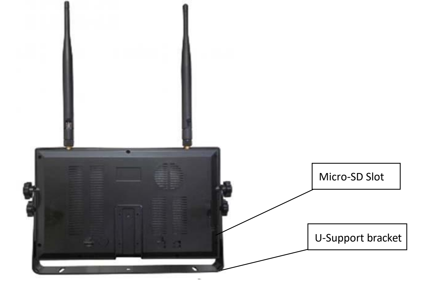
Installation of U-support Bracket