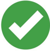
Edited true to life

-Edit your photo- Edit photos with your phone or an online photo editor. Brighten dark photos by editing the exposure or saturate muted colors. Photos should not be more saturated than the artwork is in real life.