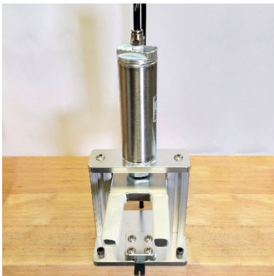
FIG. 1 – MACHINE