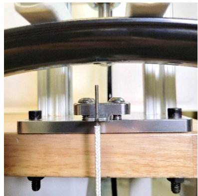
FIG 3. – PRESSING RIM