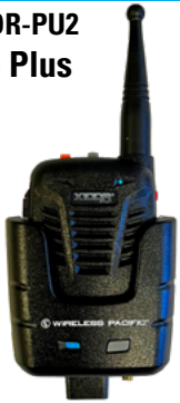
X10DR-PU2 Pro Plus