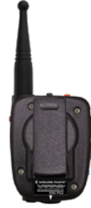
XNMC Non-metal rotary shoulder mount clip