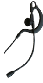
WPULH-X10 Headset Ultra-lightweight earhook style