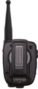
XLMC Standard long rotary shoulder mount clip