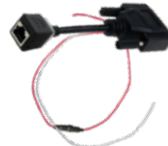
XCA-**** Radio Adaptor Refer price book (typical style)