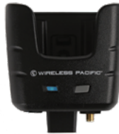
X10DR Pro Plus Gateway