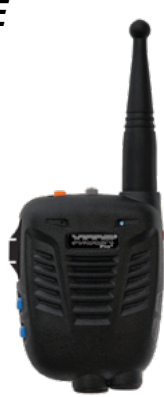
X10DR Pro Plus Handset