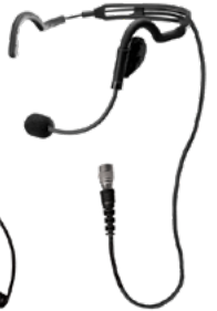
WPHFH-X10 Headset Industrial lightweight