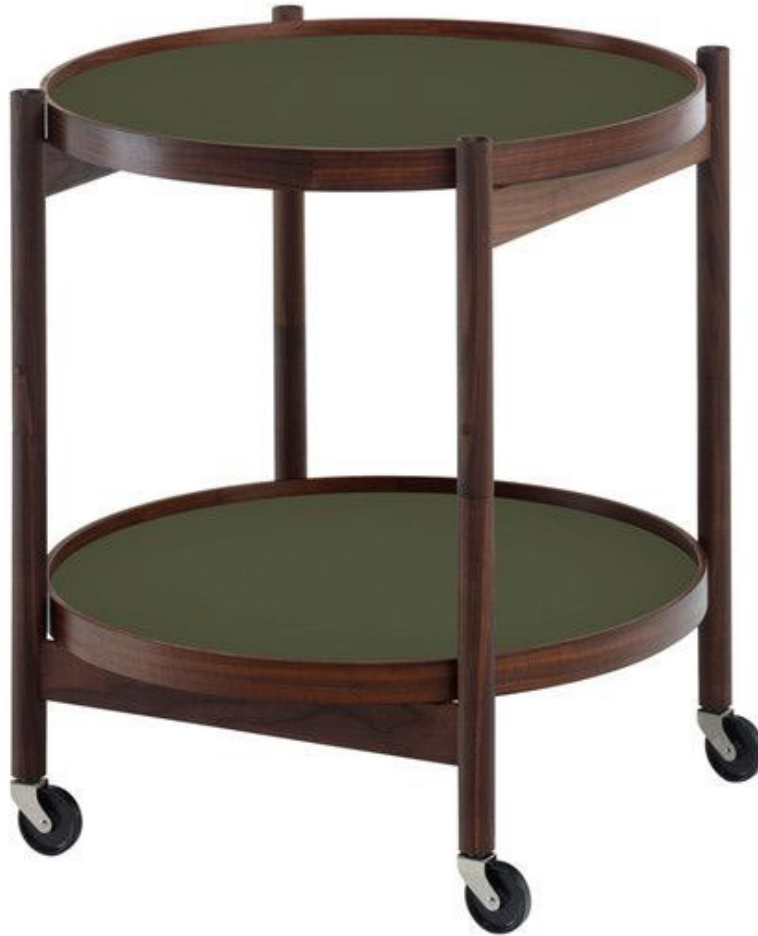
Hans Bølling Tray Table