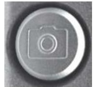
IMAGE BUTTON (2)

OLED display brightness. Each short-press increases the display brightness by one level. There are 7 brightness levels and the factory default setting is level-2. See page-11 for more image brightness adjustment information