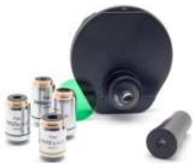
Phase and Dark Field

The LW Scientific i4 microscope features exceptional optical quality with an infinity optical system, like found on the most expensive laboratory microscopes, but at a fraction of the price. The ergonomic narrow design allows users to rest their arms flat on the table and easily operate all controls. The binocular eye tubes can also be rotated upward to achieve an additional 2 inches of height for taller users. LED lighting produces "daylight" color, with a cool temperature and long life. Comfort, durability, dependability, and superior imaging make the i4 a great value for labs, physicians, vets, and universities. The i4 microscope is intended for use as a biological microscope in a professional environment in accordance with the guidelines set forth in this operation manual.