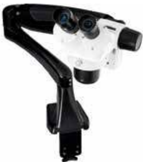
Z4 Zoom on Pneumatic Arm