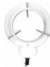
Fluorescent Ring Light