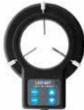
48 or 60 Bulb Variable LED Ring Light