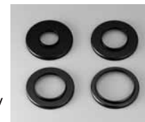
Adapter Ring TSN-AR28/30/305/37/ 43/46/52/55/58/62/72

Able to set the scope on tripod even with the case on.