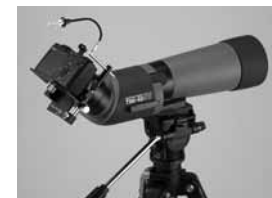
[ Digiscoping ]