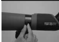
The lock screw.

The rotating tripod mount allows the spotting scope to be set at various angles while attached to a tripod. The body of the spotting scope can be turned by loosening the lock screw counterclockwise and rotating the spotting scope to the desired position.