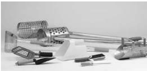
Figure 10, Various commercially available recovery tools

A trowel is best for recovering items in clay or gravel areas.