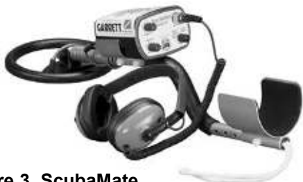
Figure 3, ScubaMate

1. Choose a desired operating / stem / control housing configuration. Assemble the stem and attach the control housing as desired. (Figure 3,4,5).