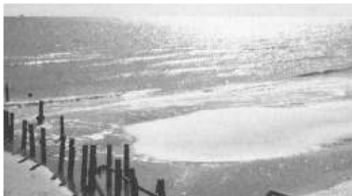
Figure 7, Surf Pattern

Study surf and weather patterns - Pay attention to storm, wind and tide activity. Treasures from deepwater vaults are often transferred to shallower locations like tidal pools and water-filled depressions near the shoreline. A beach considered unproductive can suddenly yield riches. Heavy storm waves often unearth treasures like rings caught in exposed rock and gravel areas. (Figure 7).