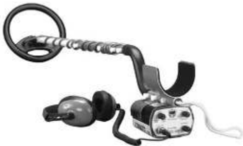
Figure 4, Full length with undercuff