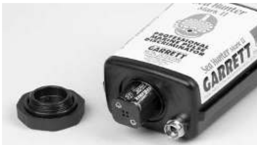
Figure 8, Proper battery pack re-installation

To access the battery pack, unscrew the battery cap at the rear of the detector housing, by hand. Do not use tools. The o-ring should remain in the control housing while the battery pack slides out. When installing batteries ensure that they are aligned with the correct polarity (plus and minus) markings. Re-install the battery pack by placing the contact end of the housing inside first and pointing downward (figure 8). Verify that the o-ring is well-lubricated and free from debris. Add a little silicon grease or petroleum