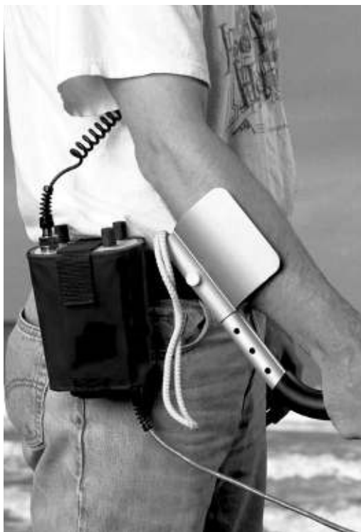
Figure 5, Long stem with hip mount configurations