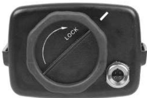
Figure 9, Proper battery cap re-installation

jelly, if necessary. Reinstall the battery cap, hand tighten it until it is flush with the housing and the two index marks are aligned as shown (Figure 9).