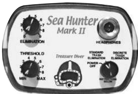
Figure 1, Panel Face

Power - Use to turn the detector on and choose either of two search modes. A battery check occurs automatically each time the power is switched on. (Figure 1)