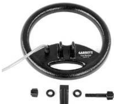
Figure 6, Parts needed to assemble stem and searchcoil

2. Attach the searchcoil to the lower stem. Align the mounting holes of the searchcoil and stem, insert the threaded bolt through the holes and hand-tighten the knobs; Do Not use tools. (Figure 6)