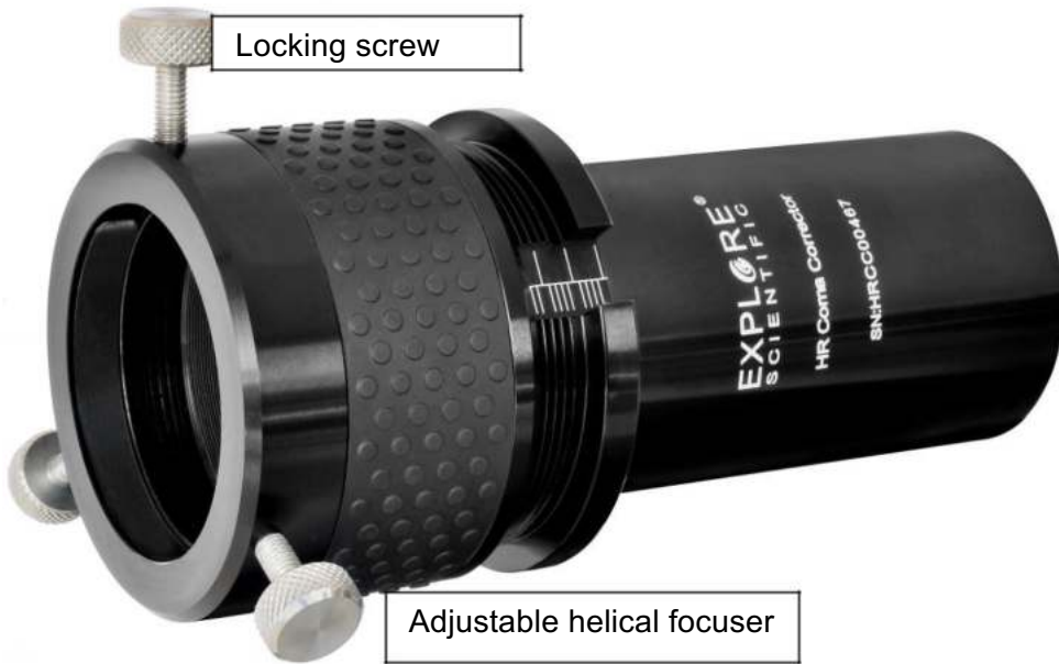
Figure 1: Front view

Congratulations on the purchase of the Explore Scientific HR Coma Correctors. You can use the HR Coma Corrector visually and photographically. When you receive the HR Coma Corrector, it is assembled for visual work. Two big parts are connected for this purpose – the base unit that includes the optical system of the HR Coma Corrector and the attached helical focuser. A small radial Allen screw secures the helical focuser. This Allen screw can be removed by using a 2mm Allen key (not part of the delivery).