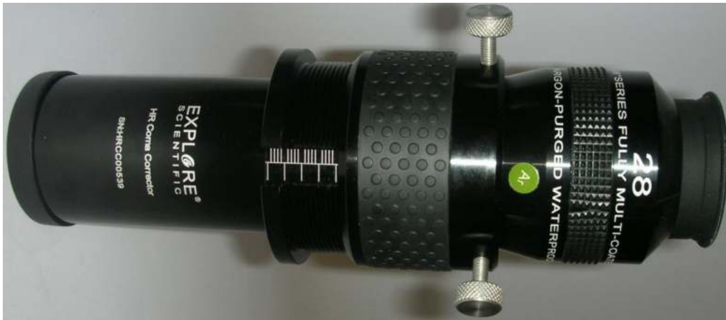
Figure 4: HR Coma Corrector with eyepiece that has a field stop 3mm below reference

Now remove the tape and insert a eyepiece into the corrector and secure it with the locking screws. Focus the eyepiece with the helical focuser by rotating the eyepiece - without touching the telescopes focuser. If you know the internal position of the field stop of your eyepiece, you can rotate directly until the correct value appears on the scale. If you – for example – know that the field stop is located 3mm below the reference surface (upper end of the eyepiece barrel), screw the helical to 13,5+3=16,5 mm and then do the fine focusing.