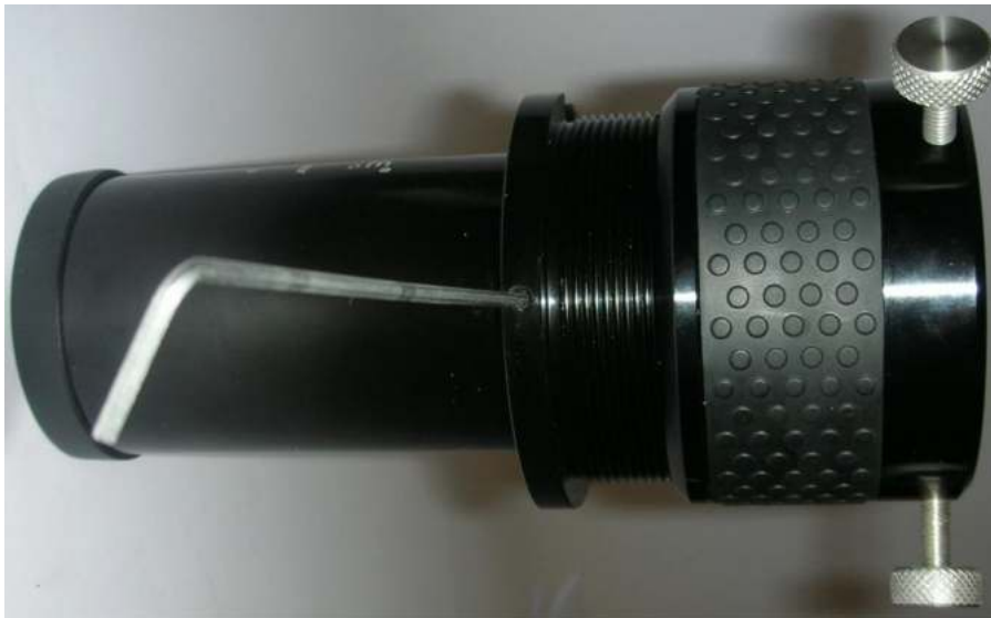
Figure 2: Back view with 2mm Allen key for the locking screw