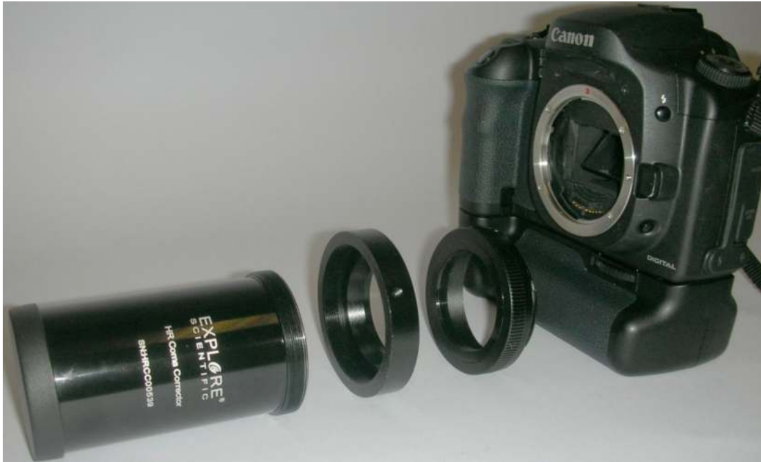
Figure 5: HR Coma Corrector with T2-Adaptor, T2-Ring and camera

For Astrophotography, the helical focuser of the HR Coma Correctors has to be removed. Remove the small radial Allen screw so that you are able to unscrew the helical focuser from the corrector body (See figure 2). You can attach the camera via two adaptors that come with your HR Coma Corrector: one adaptor with T2-thread, that you can use together with different camera bodies, like DSLRs. Please notice that you need an additional T2-ring for your specific camera model. This T2-ring is not included with the HR Coma-Corrector.