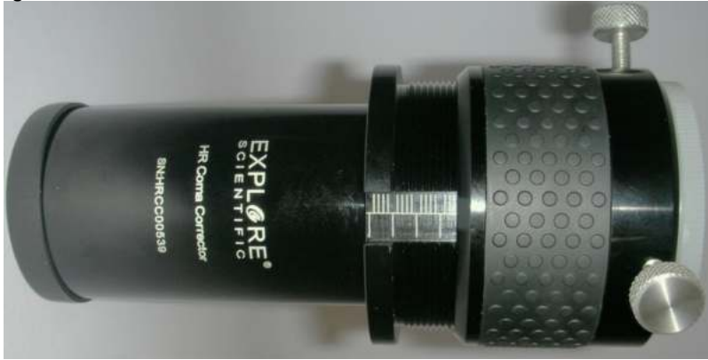
Figure 3 Zero Position

Let us configure the HR Coma Corrector first. At the side of the HR Coma Corrector you will notice a groove that contains a laser-etched scale. It shows you marks in 1mm divisions – 4 to one side and the 5 th to the other side for better overview. Screw the top end of the helical focuser out, until the rim of the movable part is 13,5mm above the lower end of the helical, as shown in figure 3.