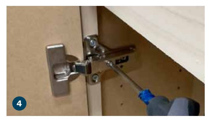
Use the screws in the hinge to adjust door placement. The front screw brings the door to and from the center when the cabinet door is closed.