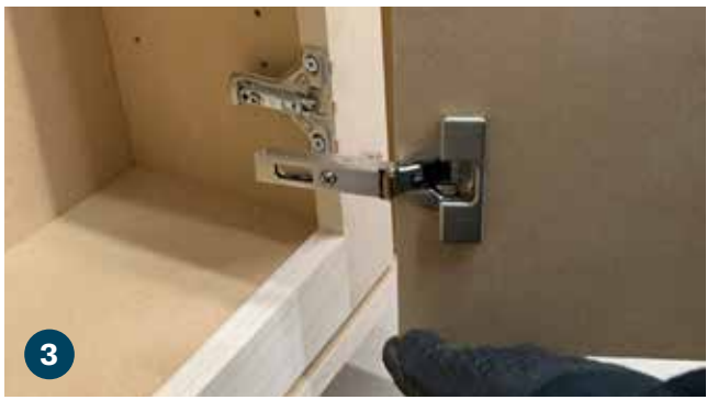
Connect the hinges to the plates installed on the bookcase. Position the small hinge hook on the hinge plate pin then press down front to secure.

Lift plate on the hinge and insert into pre-drilled depressions on the cabinet door back - standard hinges at the top, soft close hinges at the bottom. Snap shut to lock into place.