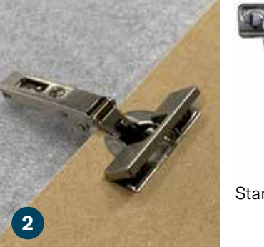
Mount hinge plates 2" from the upper and lower rail on both sides of the bookcase.