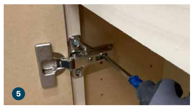
The back screw brings the door to and from the frame.