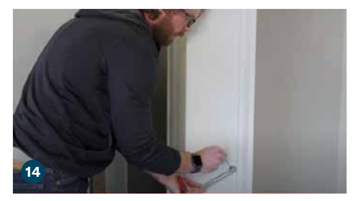
Attach the lever (J) by sliding it onto the cross shaft and tightening the catch screw using a 5/64" Allen wrench.