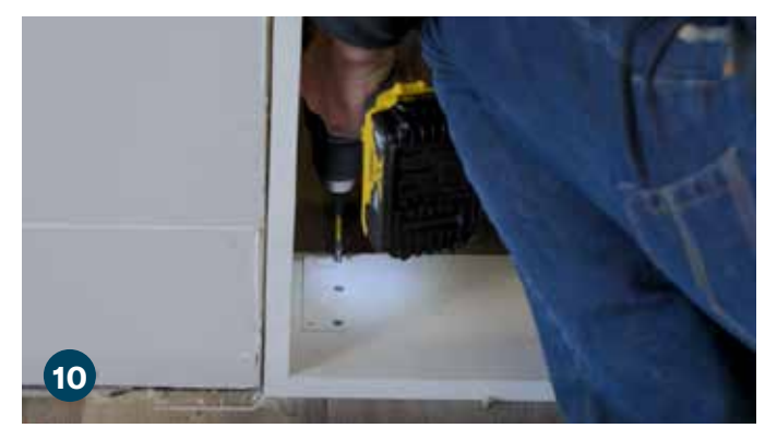
Replace the poly-wedge with the catch plate (G). Use the pre-existing holes to position the catch plate, adding 2 additional screws at the back of the plate. The ramp edge should face forward on an out-swing door and to the back on an in-swing door.