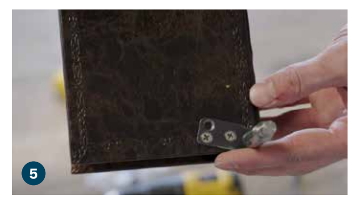
Align the cross-shaft bracket (D) to the bottom of the book back, this will be the side that does not open. Angle it so that the bottom screw hole aligns with the decorative border as shown above. Align the barrel of the pin with the vertical decorative border. Attach the cross shaft bracket to the book using (2) #6 wood screws.