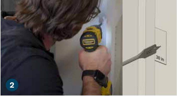
Mark the center point using the tip of a 11/16" spade bit, then drill a hole at the indicated center point using the same drill bit.

Measure 30" up from the bottom of the door and stick the drill template decal (B) to the door. The bottom edge of the black line on the decal should measure 30" from the bottom of the door, and the edge of the decal should be directly against the faceframe.