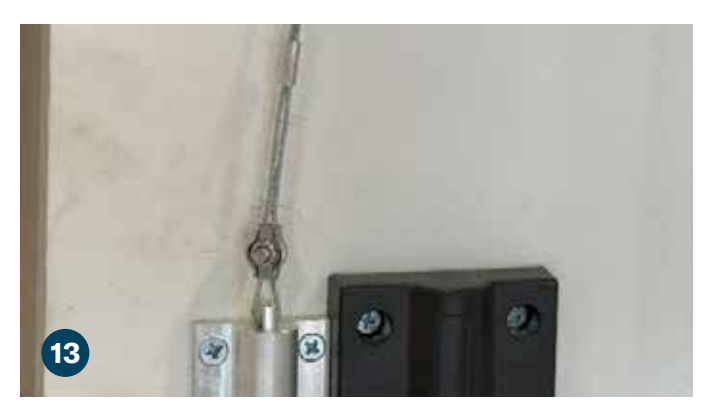
Slip the loop at the end of the cable over the hook on the catch.