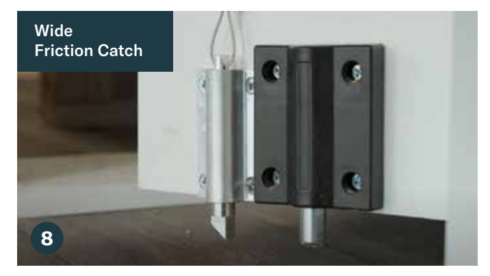
For an out-swing door, slip the floor catch into the bracket and attach the cable to hold it in place. The ramp edge should face the rear of the door. Align the bracket to the back of the friction catch flush to the bottom of the door. Attach with the largest wood screws provided.