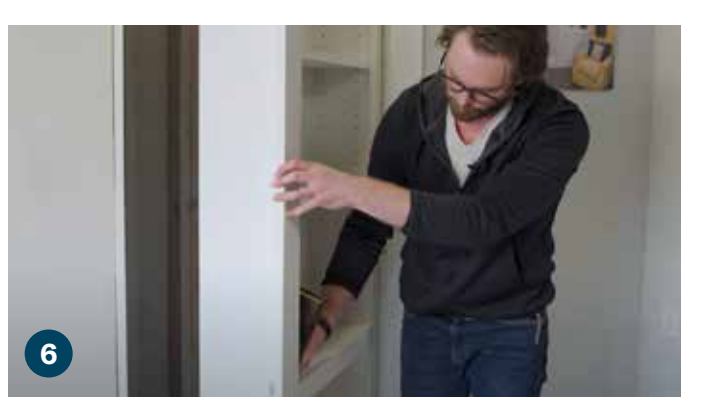
Test the book making sure that it pivots correctly.