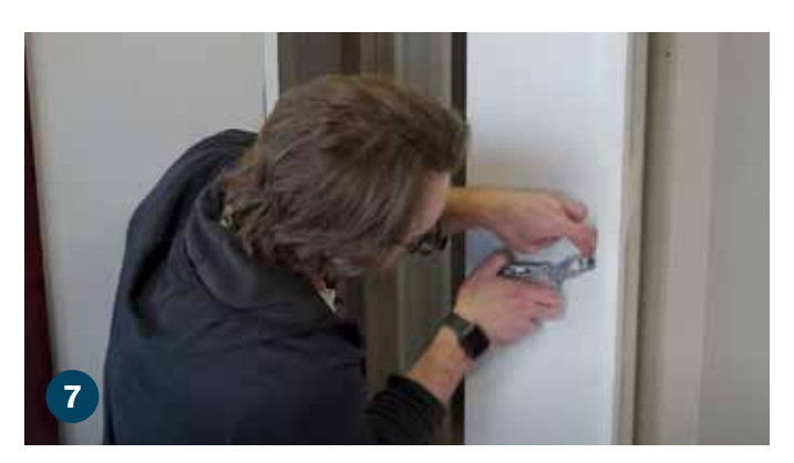
Install the E clip (E) in the groove on the cross shaft. Use a pair of pliers to snap it into place.