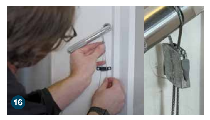
Pull the gripple tight so that it is just starting to lift the catch and feed any remaining cable through the cable guide. The gripple should sit close enough to the handle that the cable cannot slip out of the groove.

Congratulations. This completes the Hidden Door Book Latch installation.