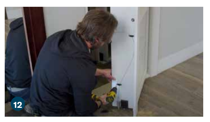
Route the pull cable (H) through the cable guides (I). Attach the top cable guide flush to the face frame, 3-4" down from the mounting bracket. Attach the second cable guide 3-4" above the floor catch creating a vertical pull on the cable.

If you are installing the book latch kit on a door with the narrow fiction catch, the existing catch plate is designed to accommodate the book latch. Align the bracket to the back edge (for out-swing) or front edge (for in-swing) of the friction catch, and flush to the bottom of the door. Attach with the largest wood screws provided.