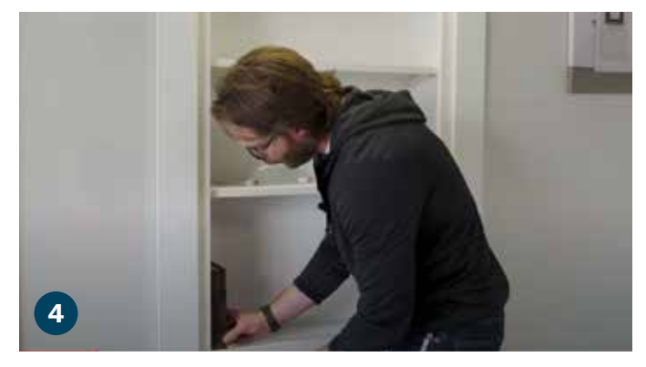
Insert the cross shaft (D) from the front side of the door making sure it slides all the way in and do a visual test fit of the book.