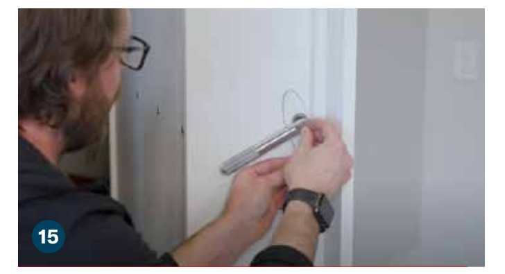
Slide the gripple (K) onto the cable through the small opening. Pull it down below the lever and loop the cable around the lever feeding it through the opposite opening of the gripple.