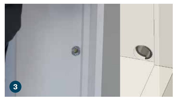
Install the mounting bracket (C) with the shoulder facing the front door and the flat edges vertical. Attach with the smallest included Phillips head screws.