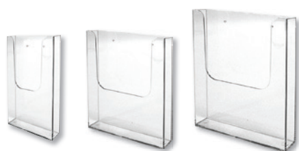
M65 HOLDER A5 HOLDER A4 HOLDER

🇩🇰 Brochureholder produceret i transparent sprøjttestøbt akryl. Til vægophæng.