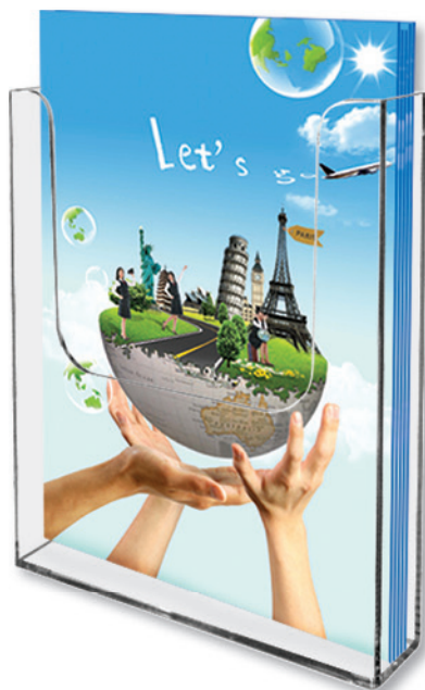
M65, A5 & A4