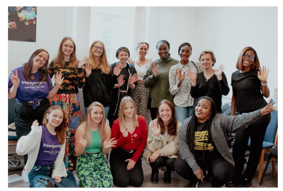
Some of the young people and their allies at the Empower Period 'Summit'

We hosted a hybrid co-production workshop and follow-up activities via our online 'Our Voice Heard' space to co-design the campaign with 60 young people, including members of Irise's Empower Period network and young campaigners from 10 other groups and organisations across the UK.