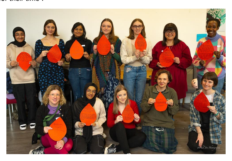
Young people at the Every Period Counts co-production workshop with their period stories

Irise's Empower Period Committee, made up of 5 young people from our network, provided accountability and oversight for the campaign. They met twice to scrutinise plans and were reimbursed for their time<sup>2</sup>.