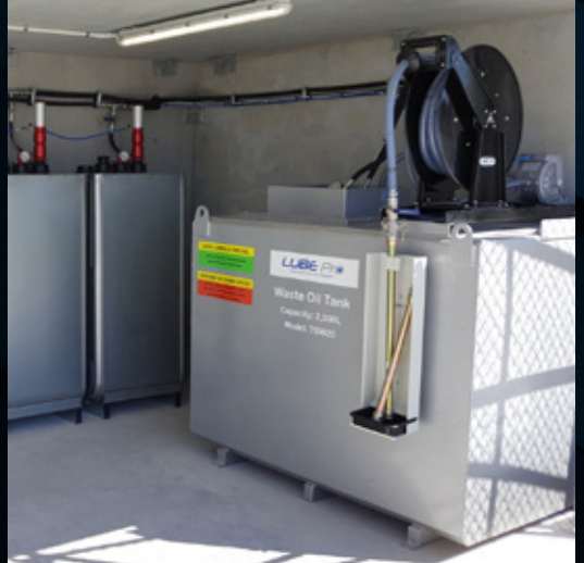
LUBE STORE WITH 2000L WASTE OIL TANK WITH MOUNTED SUCTION HOSE REEL AND PNEUMATIC WASTE OIL PUMP. TYPICALLY SUITED FOR SUCKING FROM MOBILE SERVICE VEHICLES