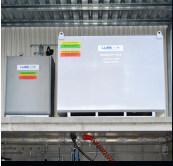
BULK OIL STORAGE SET UP CONTAINING A 4500L WASTE OIL TANK AND 1000L WASTE COOLANT TANK

Enhance both your environmental compliance and the practicality of use with our quality range of waste oil tanks.