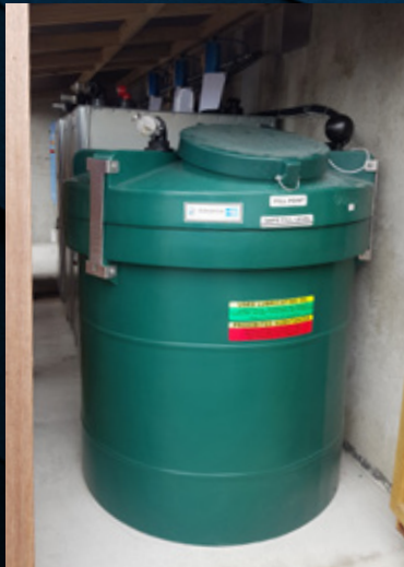
1000L PLASTIC WASTE OIL TANK WITH OUTER BUNDING TANK, INCORPORATED INTO TANK ROOM