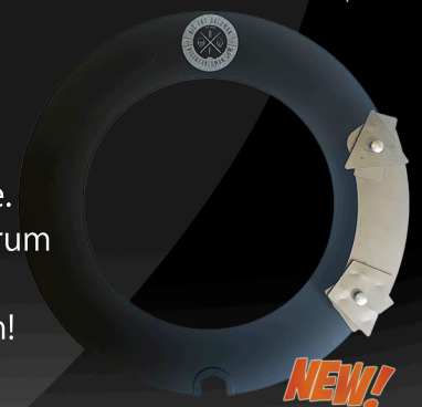
The Junky Halo RRP $79.95

The Jellyfish (left) works as an cymbal and drum sizzler with an adjustable stap and magnet for easy use. The Junky Halo (right) utilizes the classic Big Fat Snare Drum dampening technoly, while incorporating the uniqe trashy 2.0 metal sound effects from the Baldmen!