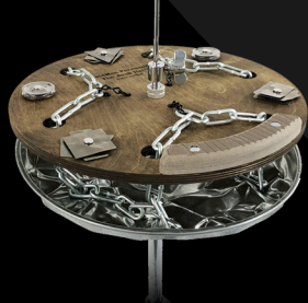
OG (14") RRP $295 2.0 (14" W/ADD ON PACK) RRP $350