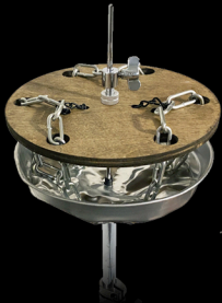
BIG MINI (10") RRP $250