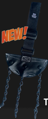
The Jellyfish RRP $52.95

The Baldman have officialy teamed up with one of their favorite companies, Big Fat Snare Drum , to release two incredible new percussion toys called The Jellyfish and The Junky Halo , which are currently blowing up!