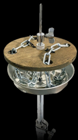
MINI MINI (8") RRP $225