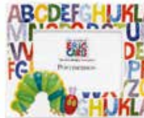
photo frame – abc 16 x 11.5cm/6.25 x 4.5in VHC78300-XD