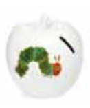
apple money box 11 x 11cm/4 x 4in VHC78302-XD