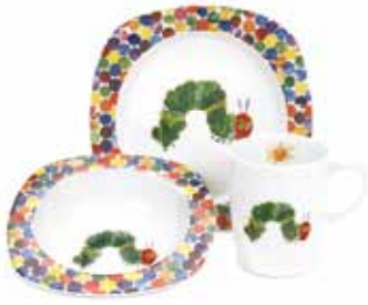
3 piece set mug: 0.17L/6fl.oz; plate: 20.5cm/8in; bowl: 18.5cm/7.2in VHC76600-X