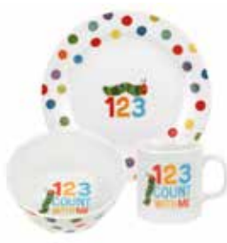
3 piece set ceramic Plate: 19cm/7.5in; Bowl: 13cm/5in; Mug: 0.2L/7fl.oz VHCNO5692-XG