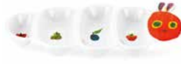
caterpillar shaped party plate 30 x 18cm/12 x 7in VHC78088-X