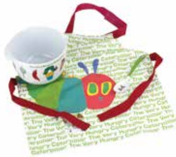
mummy's and mine set bowl: 19 x 12cm/7.5 x 4.75in spoon: 18.5cm/7.25in apron: 49 x 50cm/19.25 x 19.75in VHC78841-XW