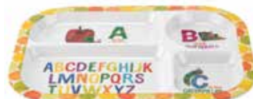
sectional tray melamine 27.8 x 20.3 x 1.5cm/11 x 8 x 0.8in VHC78978-XL

ERIC CARLE, THE VERY HUNGRY CATERPILLAR, THE WORLD OF ERIC CARLE logo, the Caterpillar logo and related designs, logos and names are trademarks and/or registered trademarks of Eric Carle LLC. All rights reserved. In The Very Hungry Caterpillar is published by Penguin Books Ltd.