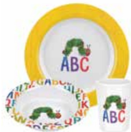
3 piece set melamine plate: 21.5cm/8.5in; bowl: 16.5cm/6.5in; beaker: 0.24L/8fl.oz VHC8444-XG