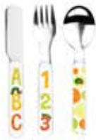
3 piece cutlery set spoon & fork 13.3 x 3.1cm/5.25in x 1.25in knife 12.7 x 1.9cm/5in x 0.75in X0013138977