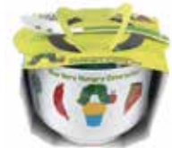
mummy's and mine set packaging