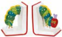
book ends 11 x 8.5cm/4 x 3.5in VHC78303-XD