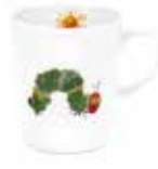
mug 0.23L/8fl.oz VHC76606-X